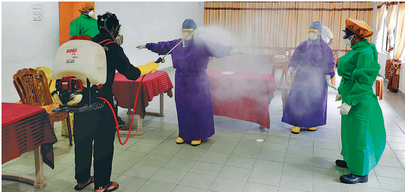
Municipal health workers are disinfected after a swab sample collecting session to test for Covid-19 in Colombo, Sri Lanka, on Tuesday.

The pandemic has now killed more than half a million people in six-and-a-half months.