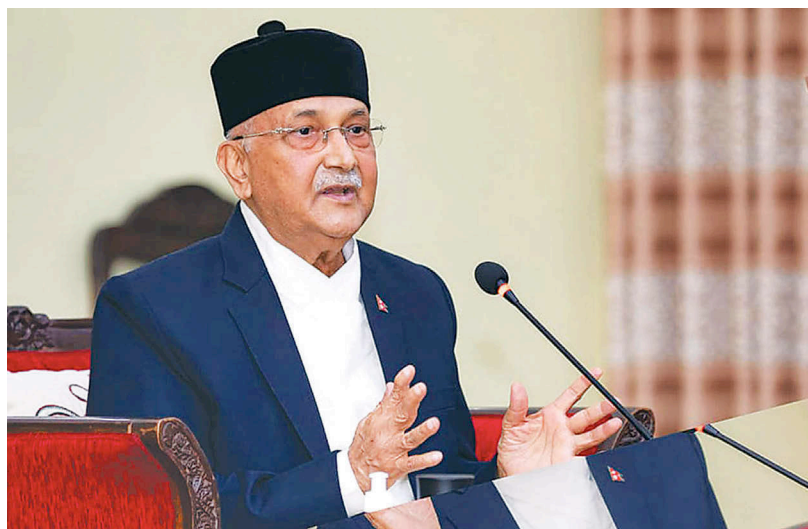
Prime Minister Oli talks at a Bhanu Jayanti ceremony in Kathmandu on Monday.

Foreign Ministry scrambles for damage control after prime minister made unfounded claims about Lord Ram's birthplace and accused India of creating a 'fake' Ayodhya.