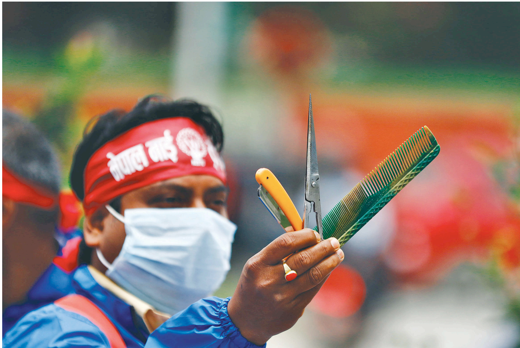
A participant of a barbers' protest in Kathmandu on Tuesday, demanding relief as their business had been severely affected by the restrictions enforced to contain the spread of Covid-19.