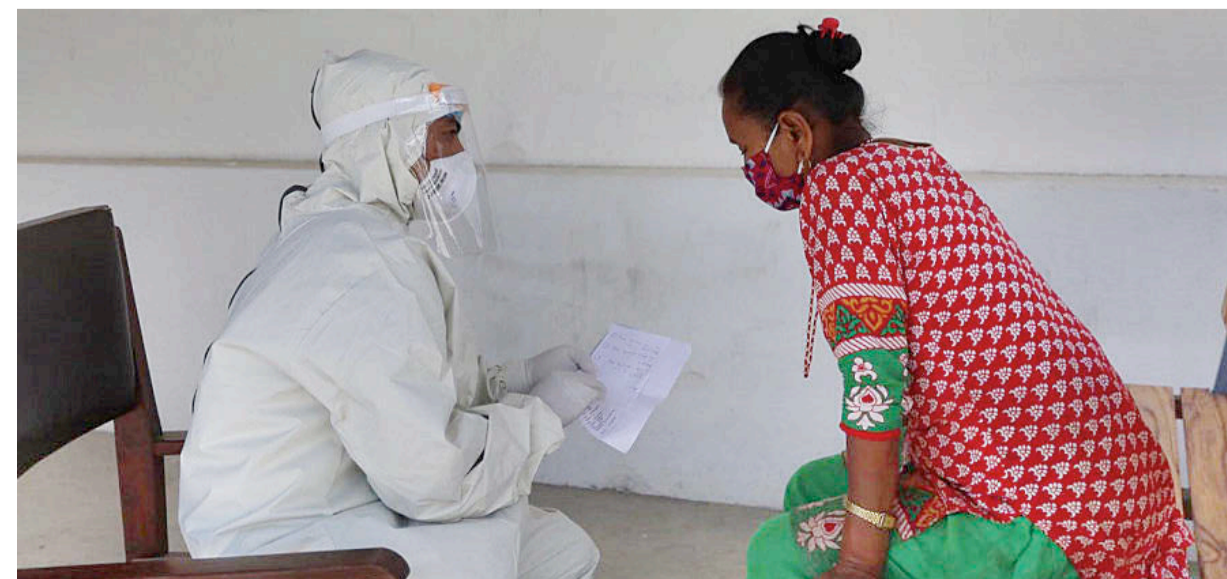
The National Mental Health Survey-2020 showed that 10 percent of the adult population has suffered from mental health problems in their lifetime and 4.3 percent currently have mental disorders.