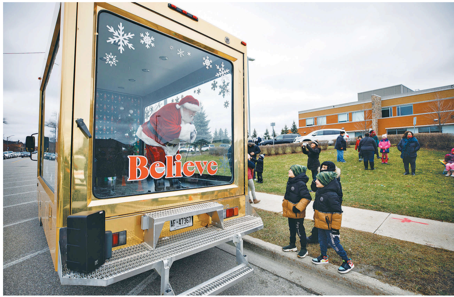
A man dressed as Santa Claus greets children from a glass enclosure in Vaughan, Ontario, Canada. Vaughan cancelled their seasonal in-person visits with Santa amid the continuing Covid-19 pandemic.