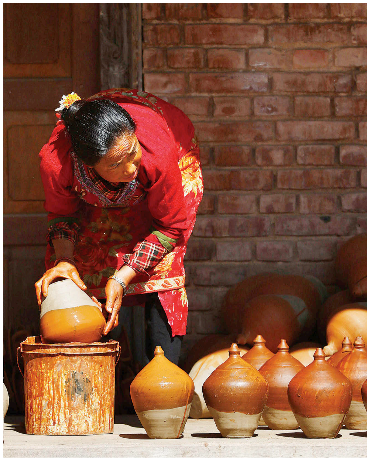
A woman puts clay piggy banks to dry at the pottery square, in Bhaktapur on Monday.