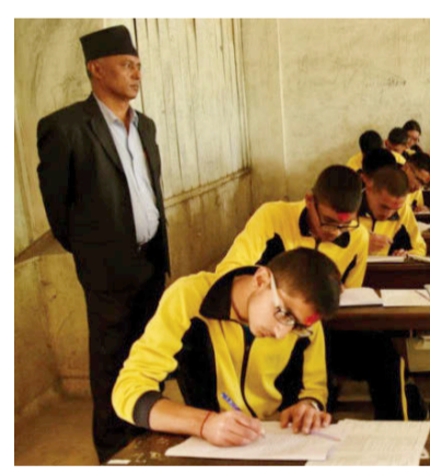
Schools started grade 11 classes a month after the National Examination Board on August 17 published the results of the Secondary Education Examinations.

While the Supreme Court's interim order may have offered respite to private schools, it has also caused confusion among government-run schools,