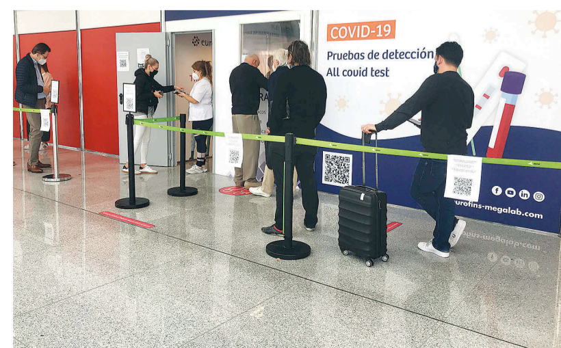
People wait in queue outside a coronavirus disease test site at Son Sant Joan airport in Palma de Mallorca, Spain.

"Now, you go out onto the street ... and there is no one."