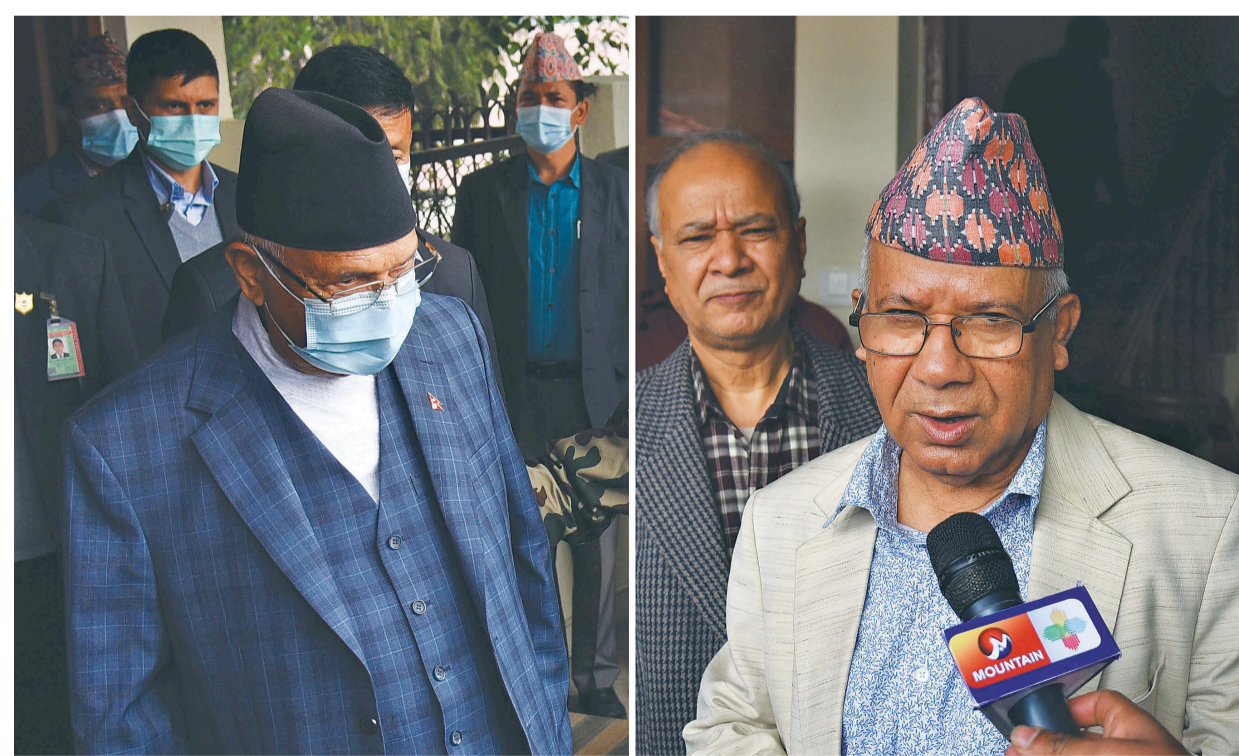
Insiders say Madhav Kumar Nepal has been badly cornered in the party by KP Sharma Oli.

"Ever since he dissolved the Central Committee of UML, his moves have no meaning and they are illegal. I reject and denounce this action," Nepal told the Post. "I would also appeal to all the cadres of the party to stand strongly against Oli's regressive moves."