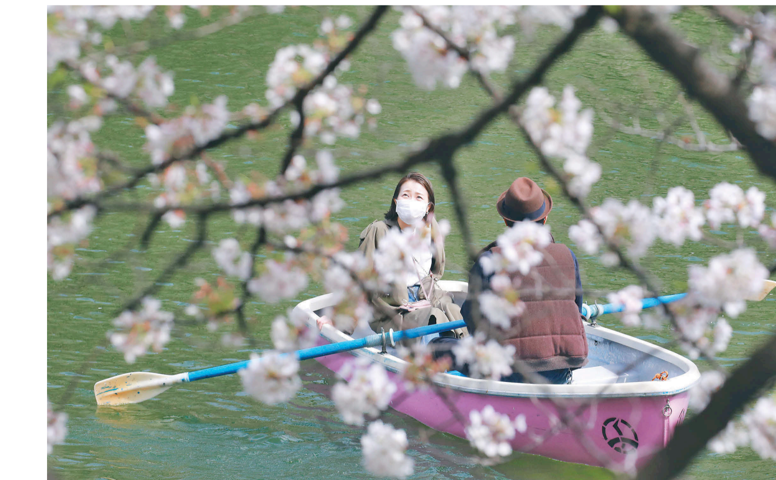
People wearing face masks to help protect against the spread of coronavirus enjoy blooming cherry blossoms from paddle boats in Tokyo on Monday.

In the draft obtained by the AP, the researchers listed four scenarios in order of likelihood for the emergence of the coronavirus named SARS-CoV-2. Topping the list was transmission from bats through another animal, which they said was likely to very likely. They evaluated direct spread from bats to humans as likely, and said that spread through "cold-chain" food products was possible but not likely.