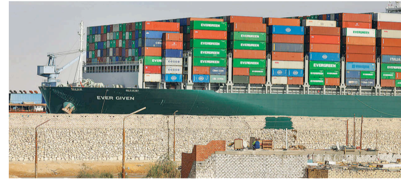
Ship Ever Given, one of the world's largest container ships, is seen after it was fully floated in Suez Canal, Egypt on Monday.

Maersk was among shippers rerouting cargoes around the Cape of Good Hope, adding up to two weeks to journeys and extra fuel costs.