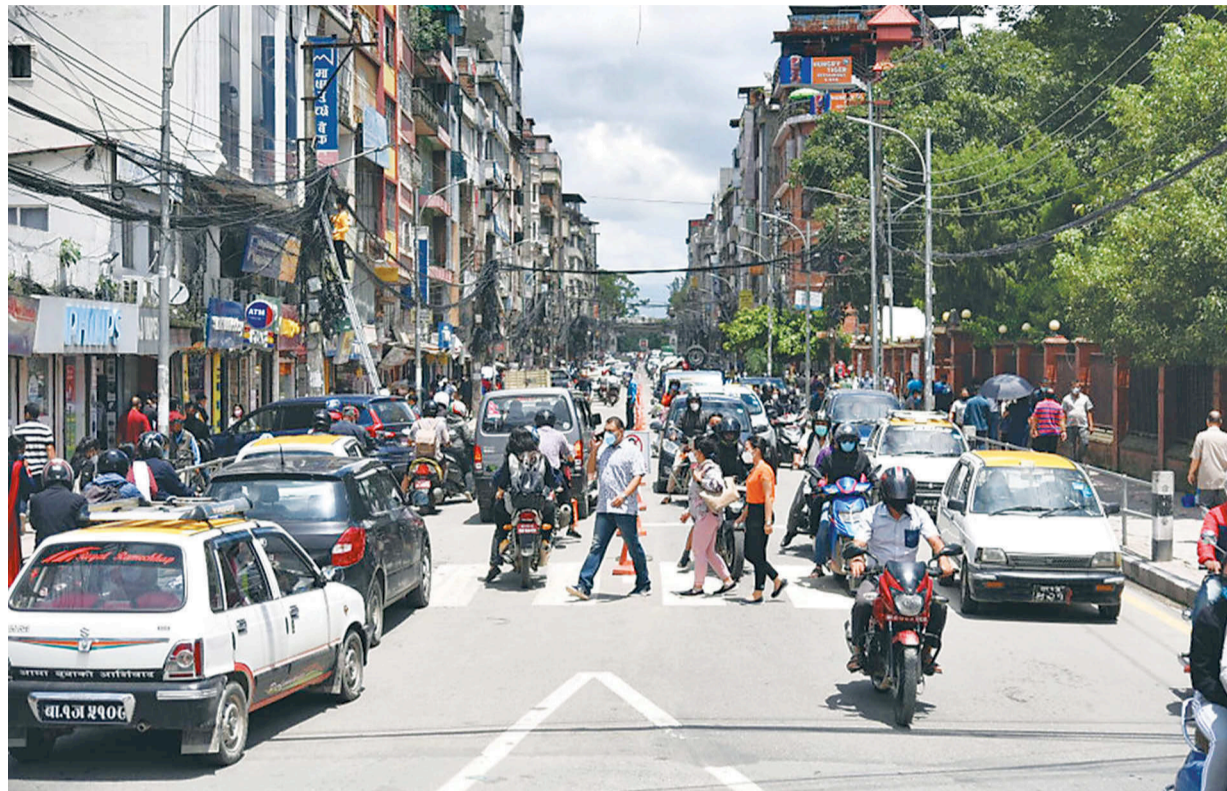
Freedom from crowded public transportation, ease of driving and economics are the main reasons second-hand vehicles have become popular, according to dealers.

According to him, the price of old scooters depends on the condition and lot number. "I could sell 15-20 second-hand scooters daily if I had enough inventory, but there are more buyers than sellers."