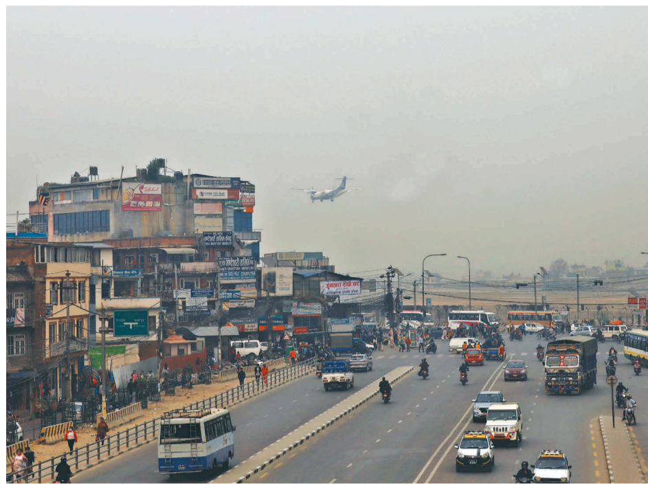
A domestic flight lands at Tribhuvan International Airport, Kathmandu on Monday. Only a handful of flights landed at the airport on Monday due to poor visibility caused by heavy smog.