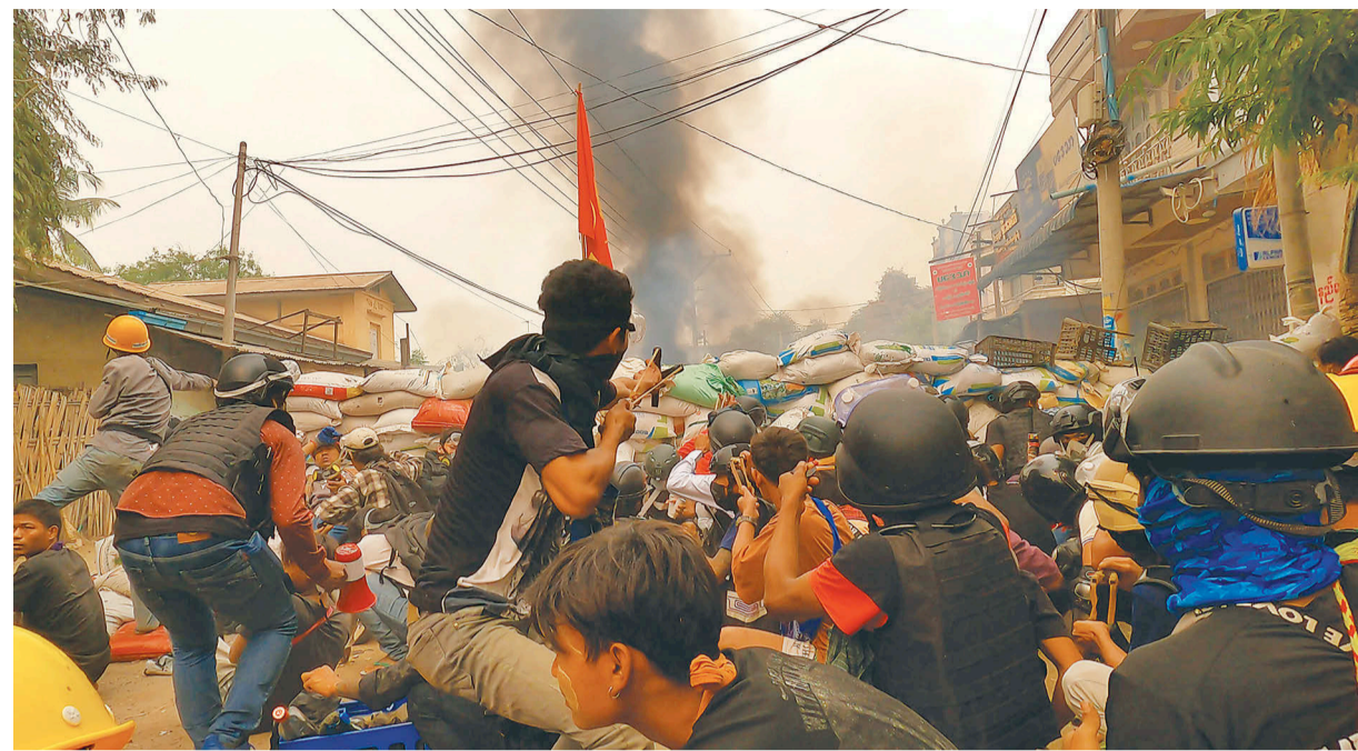
Protesters use slingshots while taking cover behind a barricade as smoke rises from burning debris during ongoing protests against the military coup, in Monywa, Sagaing region, Myanmar on Monday.

protests, the General Strike Committee of Nationalities, called in an open letter on Facebook for ethnic minority forces to help those standing up to the "unfair oppression" of the military.