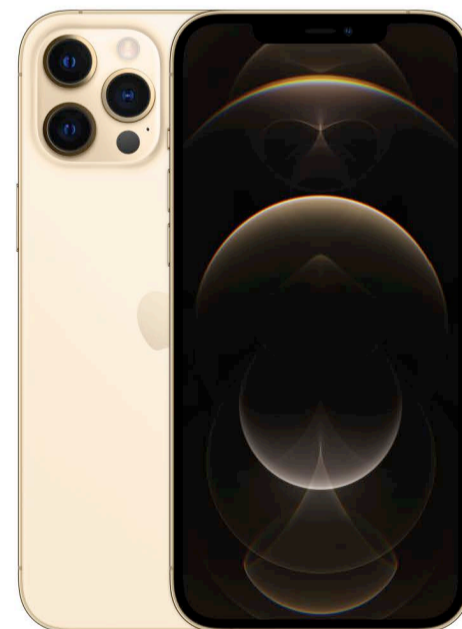
iPhone 12 Pro Max