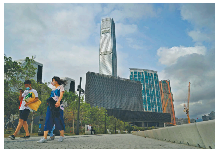
People walk in front of 'M+' visual culture museum in the West Kowloon Cultural District of Hong Kong.

Amid the decisions that were taken, concerns are being raised that Beijing's crackdown on dissent in the city is extending to arts and entertainment.