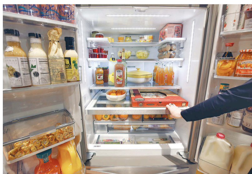
A Whirlpool French Door refrigerator is shown during a trade show in Las Vegas.

earnest in late December, was caused in part as automakers miscalculated demand and pandemic-fuelled sales of smartphones and laptops surged. It forced carmakers including General Motors to cut production, and increased costs for smartphone makers such as Xiaomi Corp.