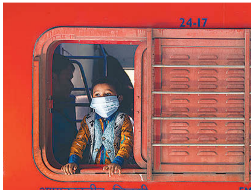
A boy wearing a face mask looks through the window of a train at a railway station in Gauhati, India, on Monday.

The rise in cases comes amid setbacks in the worldwide vaccination campaign and deepening crises in many places beyond India, including Brazil and France. Over the weekend, the global death toll from the corona-