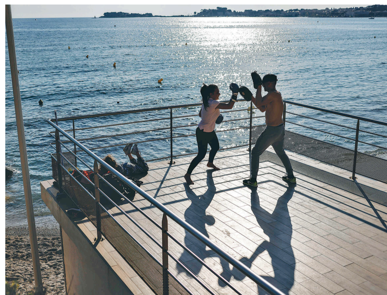
Boxers train outside as indoor gyms are still close due to the coronavirus, next to the beach in Bandol, south France, on Monday.

The Paris agreement encourages countries to submit more ambitious climate pledges if they are able to do so. China has already promised enhanced actions as it tries to meet its goal to become "carbon neutral" by 2060.