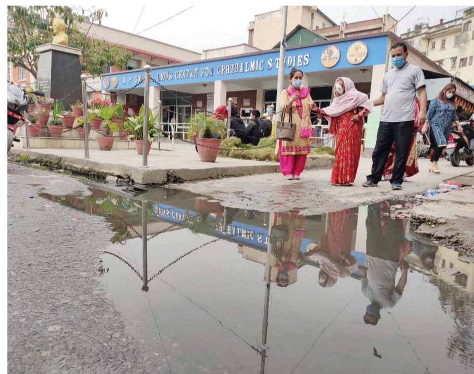
Urban planners say hospitals themselves should manage drainage and garbage problems on their premises.

"For the problem at Thapathali it's KMC's responsibility, but for the Bir Hospital KUKL is responsible, but the KMC has been volun-