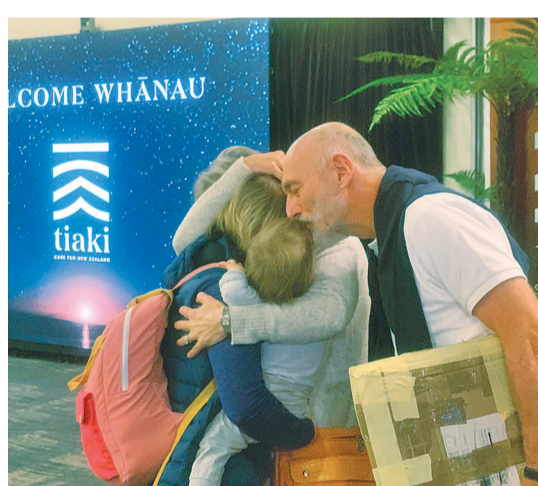
Passengers arriving from Sydney at the Wellington International Airport hug loved ones in New Zealand.

New Zealand Prime Minister Jacinda Ardern said her country was welcoming the new arrivals.