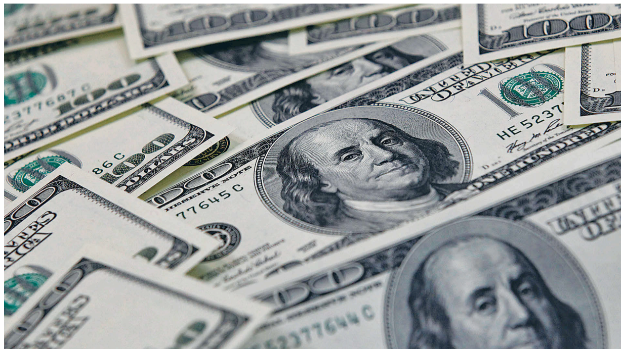
US one hundred dollar notes are seen in this picture illustration.

The ministry had proposed to relax imports of luxury vehicles, betel nuts,