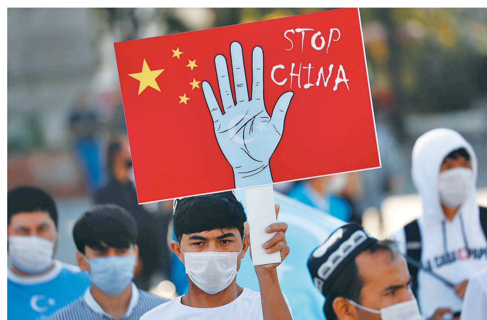
Ethnic Uighur demonstrators take part in a protest against China, in Istanbul, Turkey last October.