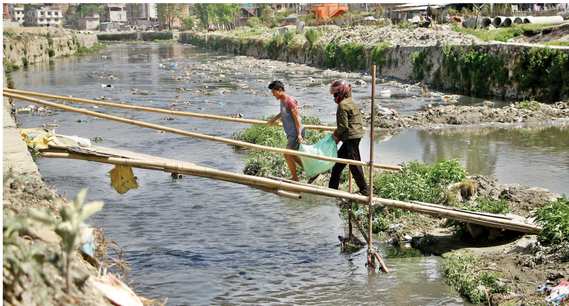
People cross a makeshift bamboo bridge over the Manohara River at Balkumari, Lalitpur on Monday.