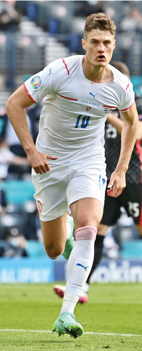
Patrik Schick has taken his tally for the tournament to three goals, his two coming against Scotland in the opening match.

Patrik Schick’s penalty helps the Czechs hold Croatia to a 1-1 draw and earn four points while the latter also have chances of advancing.