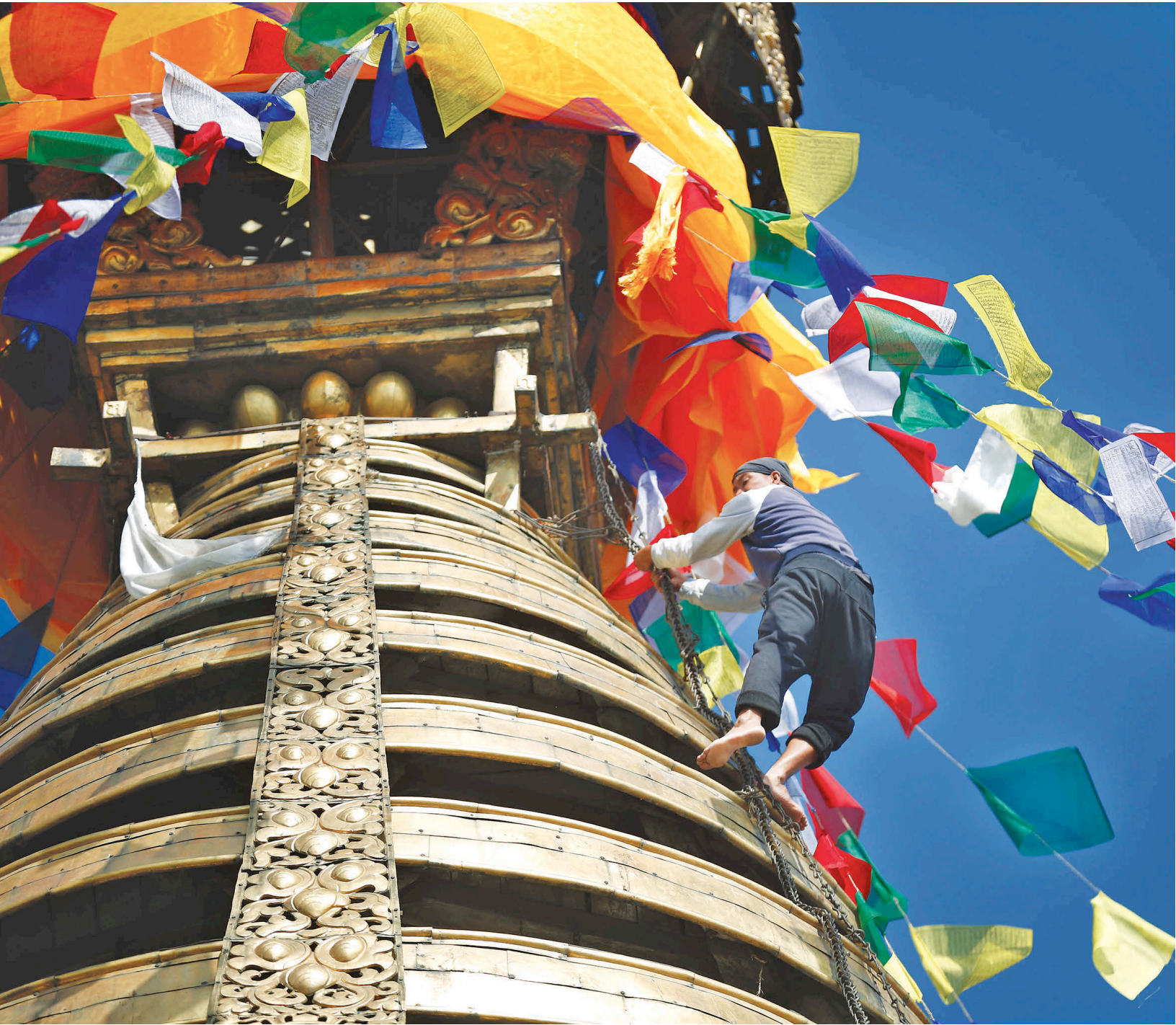
A man ties strings of prayer flags to the spire of the Swayambhunath stupa in Kathmandu on Wednesday.

"Some day I want to see myself behind the wheel. Hopefully, I will have a young woman working in my place, assisting me as a ticket collector."