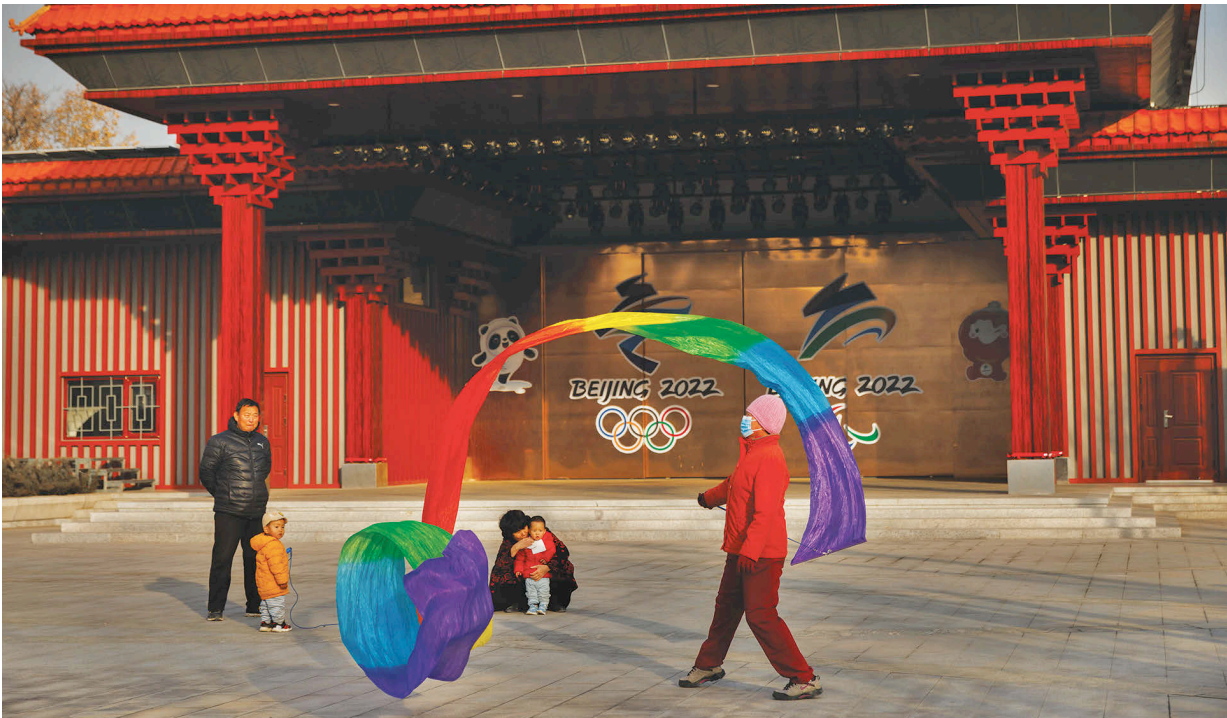
A woman flies a ribbon near the logos of the Beijing 2022 Olympic and Paralympic Games in a park in Beijing, China, on Wednesday.

on athletes’ preparations for the Games, which run from February 4 to 20, adding that “diplomatic options” were a matter for governments. Other US allies have been slow to commit to joining the boycott. Japan is considering not sending cabinet members to Games after the United States announced its diplomatic boycott, the Sankei Shimbun daily said on Wednesday, citing unidentified government sources. A South Korean presidential official said the country is currently not considering a diplomatic boycott. President Joe Biden’s administra-