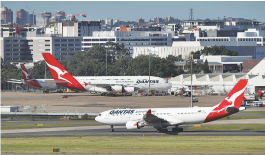
Qantas planes are seen at Kingsford Smith International Airport in Sydney.