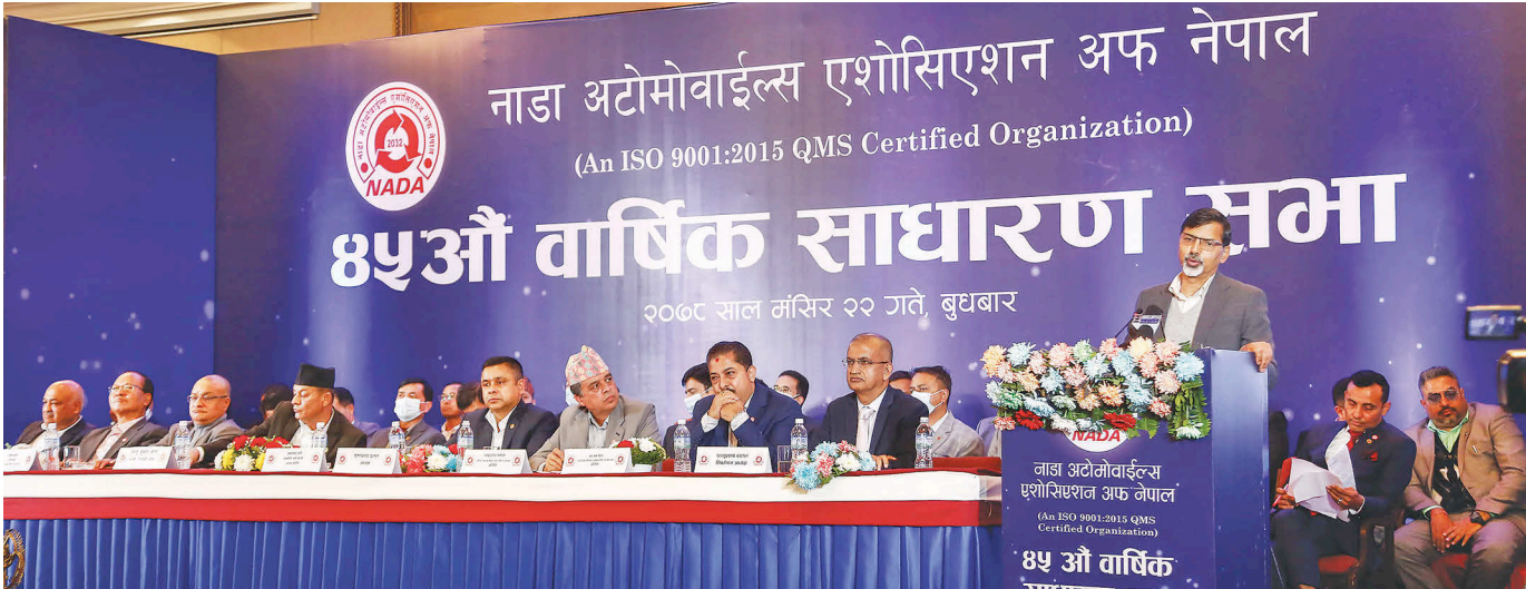
Finance Minister Janardan Sharma addresses the 45th Annual General Meeting of NADA Automobiles Association of Nepal in Kathmandu on Wednesday. NADA is electing its new executive committee on Thursday.

British Council Services Nepal Private Limited is committed to a policy of equal opportunity. British Council Services Nepal Private Limited is committed to safeguarding and promoting the welfare of children and young people and expects all of its partners to share this commitment. In line with the British Council’s Child Protection policy, any appointment is contingent on thorough checks. In the UK, and in other countries where appropriate systems exist, these include criminal records checks