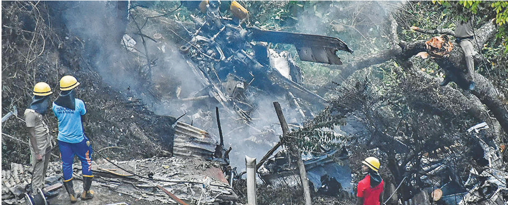
Firemen and rescue workers stand next to the debris of the helicopter crash site in Coonoor, Tamil Nadu.

Indian defence chief General Bipin Rawat and 12 other people were killed in a helicopter crash on Wednesday, with one survivor being treated for his injuries. Rawat was India’s first chief of defence staff, a position that the government established in 2019, and was seen as close to Prime Minister Narendra Modi. The 63-year-old was travelling with his wife and other senior officers in the Russian-made Mi-17 chopper, which crashed near its destination in southern Tamil Nadu state. “His untimely death is an irreparable loss to our Armed Forces and the country,” defence minister Rajnath Singh said on Twitter. Footage from the scene showed a crowd of people trying to extinguish the fiery wreck with water buckets while a group of soldiers carried one of the passengers away on an improvised stretcher. Rawat was headed to the Defence Services