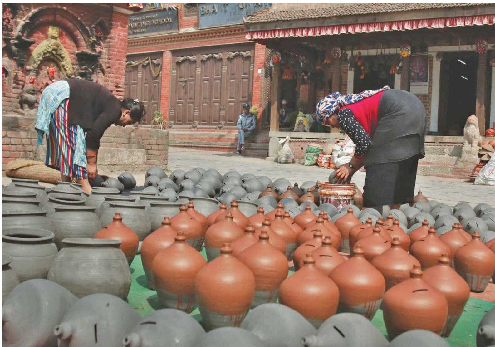
Women dip clay pots into a bucket of colour at Pottery Square in Bhaktapur on Tuesday.