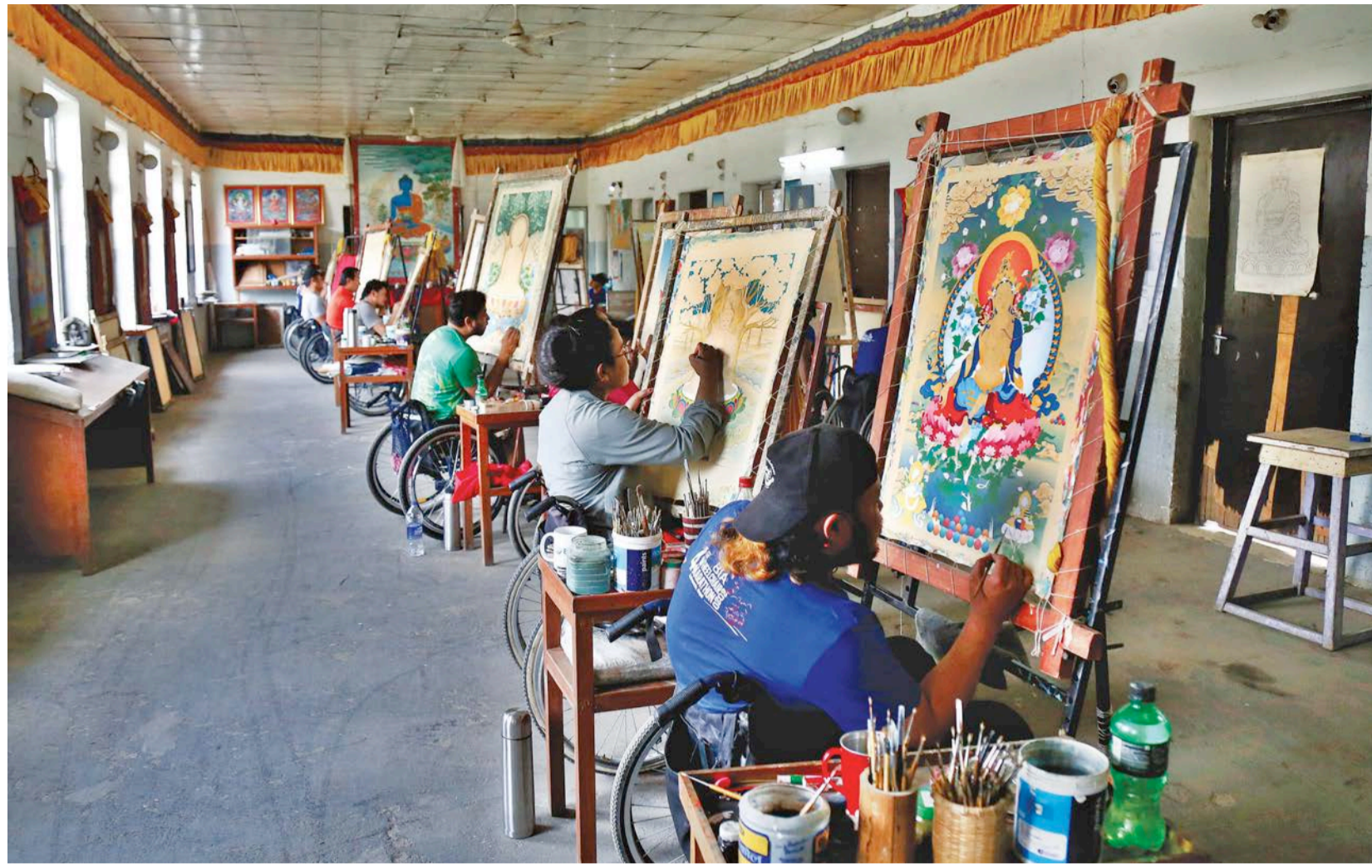
Students on wheelchairs paint thangkas at an institute in Jorpati, Kathmandu on Tuesday. Besides learning the skill, they also make some money from the activity.