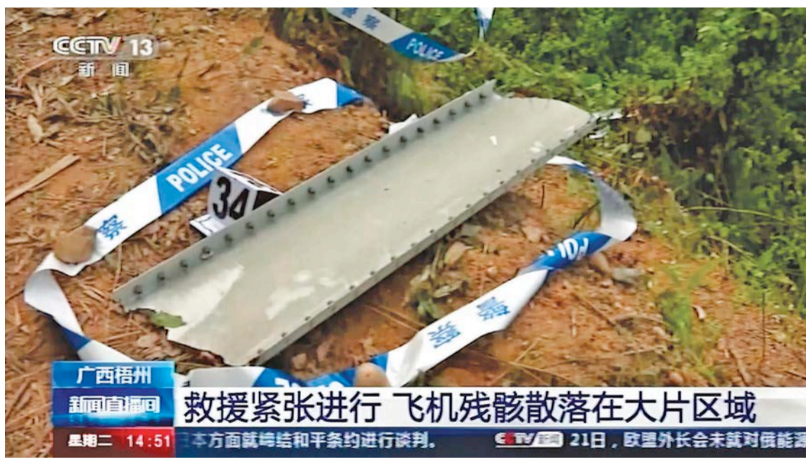
In this image taken from a video footage, debris is surrounded by police tape at the crash site in Tengxian in Guangxi Zhuang Region.