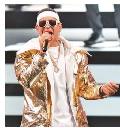
ASSOCIATED PRESS NEW YORK

The musician is one of the biggest idols in Latin music.