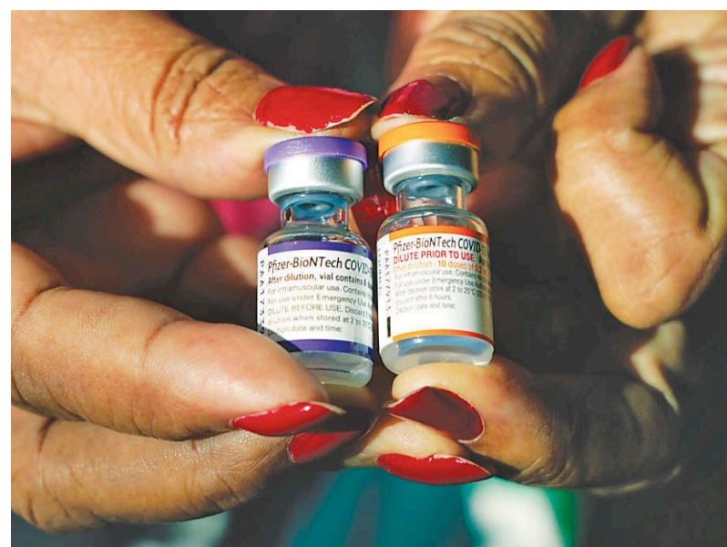
A nurse holds a vial of the Pfizer Covid-19 vaccine for children aged 5-11 (right) and a vial of the vaccine for adults, which have different coloured labels, in Mississippi in February.

The government is planning to procure 8.4 million doses of the Pfizer-