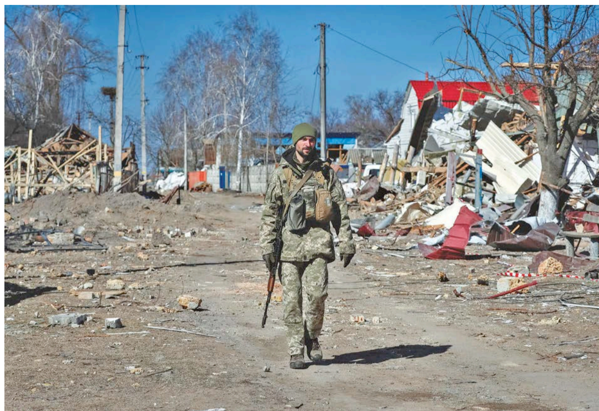
A Ukrainian soldier walks, as the Russian invasion continues, in a destroyed village on the front line in the east Kyiv region, Ukraine on Monday. (REUTERS)

Mariupol is the biggest city still held by Ukraine in the Donetsk region,