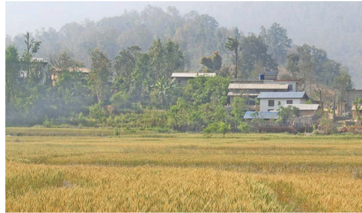
Ten out of 40 families in Haukhola settlement have already migrated to other places due to the fear of wild animals.

Devkota, who is currently a member of the National Assembly, said there must be a level playing field for all candidates of local elections. "There are reports that local representatives have started spending on development projects to woo voters," Devkota said. "There is no mechanism to check such activities. The election body's code of conduct could be useful to check them to some extent."