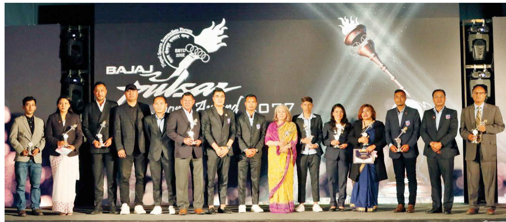
Winners of the NSJF Pulsar Sports Award pose for a group photo at the end of the award ceremony at the Nepal Academy Hall in Kathmandu on Tuesday.