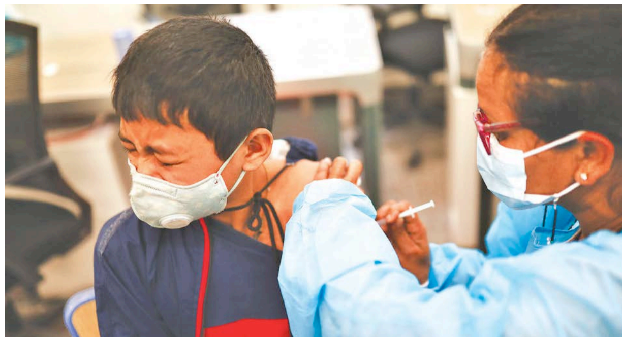
The Pfizer-BioNTech vaccine is the only jab recommended by the World Health Organisation for use in children between five and 11 years old.