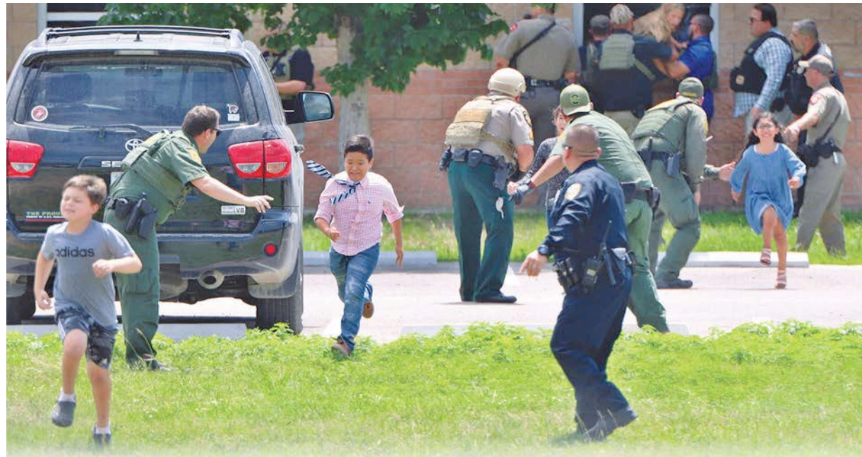
Children run to safety during a shooting at Robb Elementary School where a gunman killed 19 children and two adults in Uvalde, Texas.