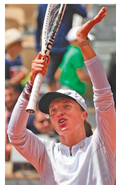
Iga Swiatek’s winning streak is the best on tour since Serena Williams’s run of 34 successive victories in 2013.