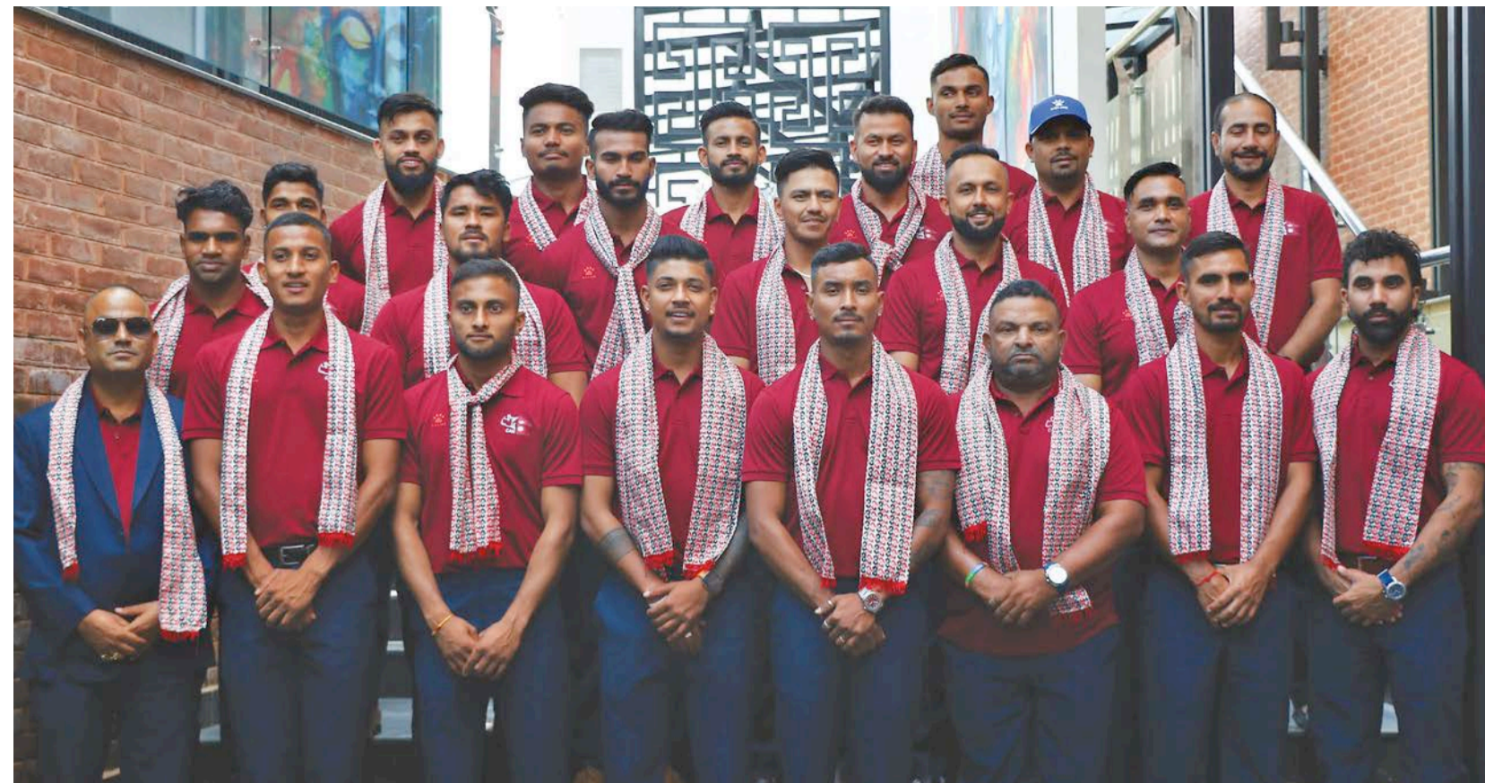
Nepal national cricket team departed for the United States on Saturday to participate in the US Triangular Series of the ICC World Cup League 2, scheduled from June 6-16.

Captain Sandeep Lamichhane says that the performance will be vital to shape the path for World Cup Qualifiers.