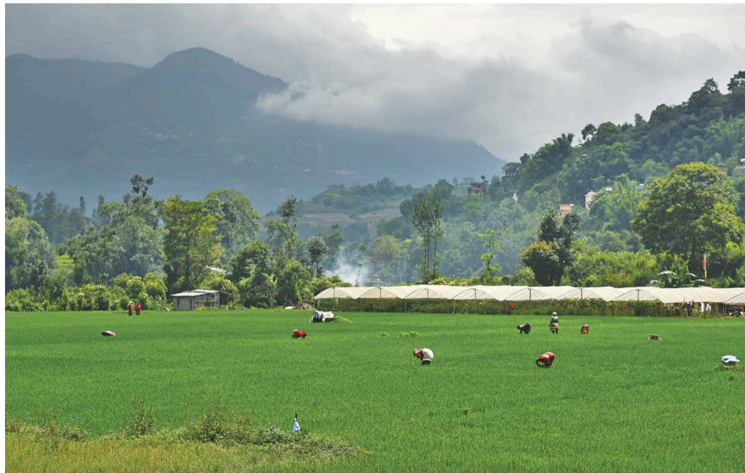
Workers weed a paddy field at Khokana in Lalitpur. An ongoing fertiliser crisis worries farmers.

NEW DELHI: India needs to achieve higher economic growth by focusing on exports and expanding production-linked incentives for more sectors to create more jobs, Singapore's minister Tharman Shanmugaratnam said on Friday. "India needs much higher growth and much deeper inclusivity ... India must grow by at least 8 percent to 10 percent over the next 25 years," Shanmugaratnam, minister in charge of the Monetary Authority of Singapore, said while delivering a lecture in memory of Arun Jaitley, India's former finance minister. He said higher economic growth was the only way to lift average incomes and create jobs for the country's large young population. (REUTERS)