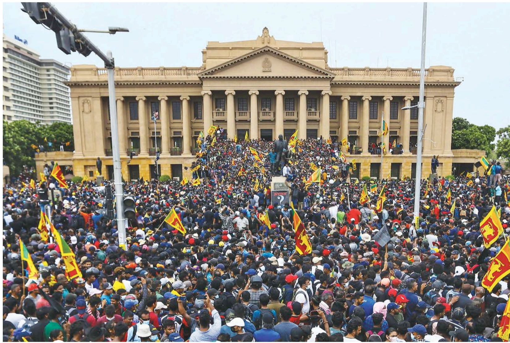
Protesters, many carrying Sri Lankan flags, gather outside the president's office in Colombo, Sri Lanka, as they stormed Gotabaya Rajapaksa's residence and nearby office on Saturday.

Wickremesinghe says he suggested president form all-party Cabinet, but says nothing about Rajapaksa's whereabouts.