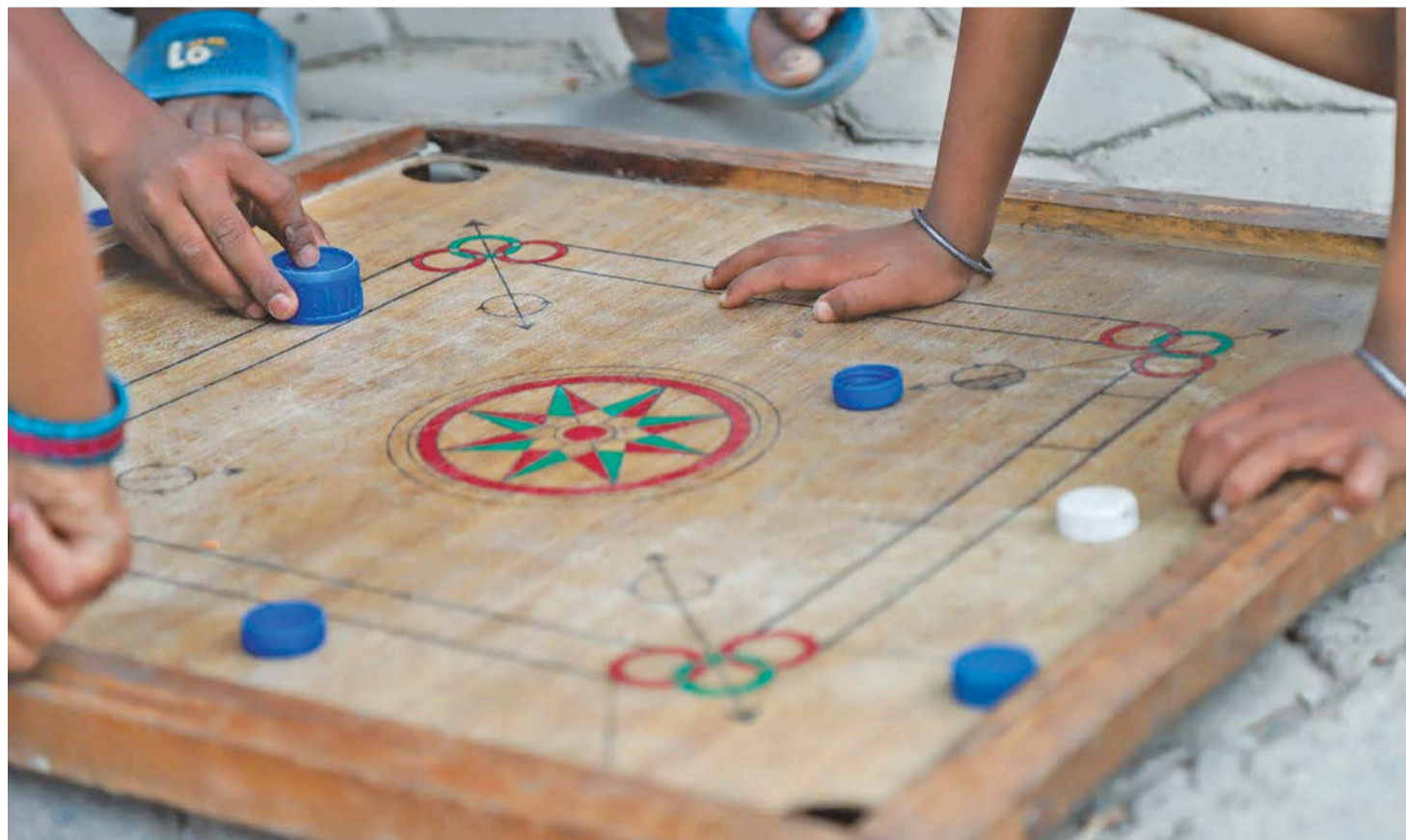
Children play carrom with plastic bottle lids as striker and coins at Teku in Kathmandu.

"Foreign contractors don't work even when a small problem arises," he said. "Domestic contractors run behind policymakers to clear the hurdles." But limited competition could increase the cost for the government. "As long as prices quoted by the domestic contractors are lower than the estimated cost, it should not be considered as costly to the government," Sapkota said.