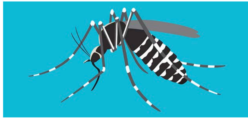
Dengue is transmitted by female Aedes aegypti and Aedes albopictus mosquitoes.

Although post-monsoon is considered a high transmission season for the dengue virus, Nepal has witnessed