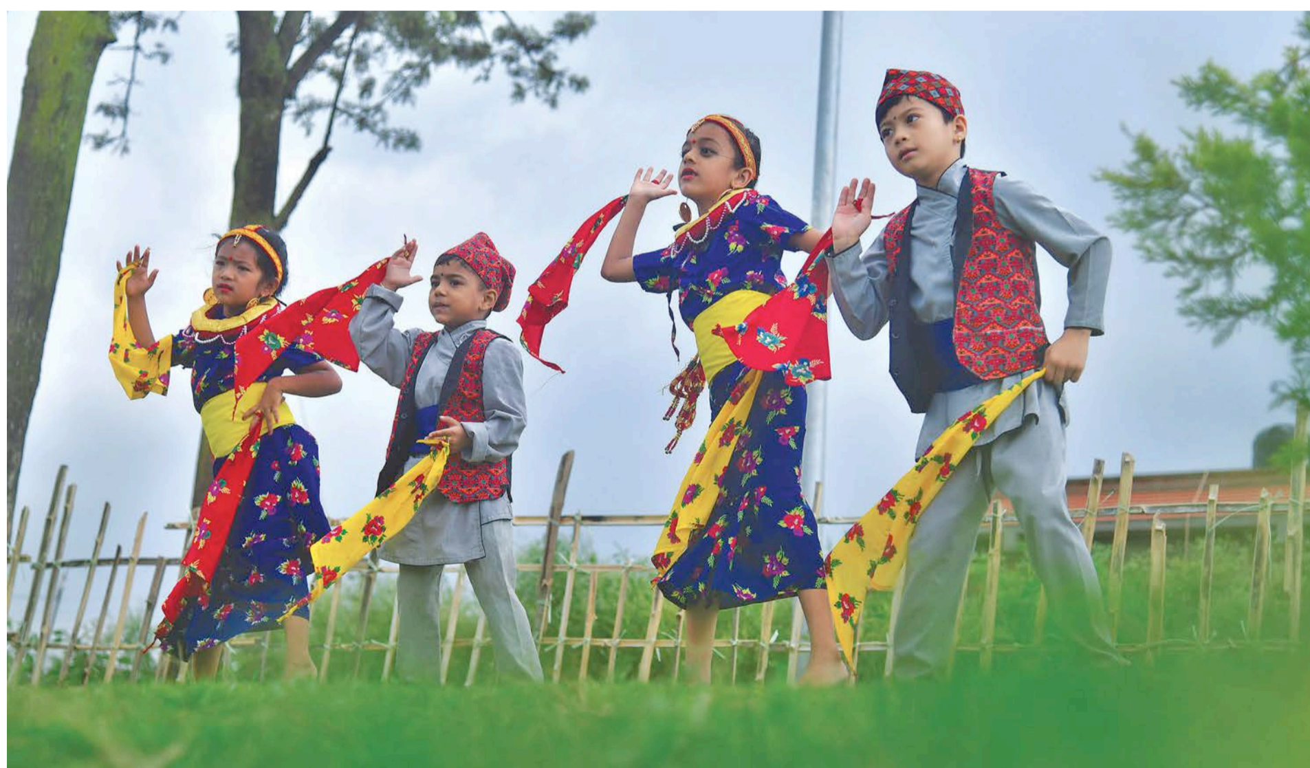
Children in cultural attire perform a dance at Kupondole in Lalitpur on Saturday.

WORK completion at the Bheri Babai Diversion Multipurpose Project in Bheriganga Municipality, Surkhet.