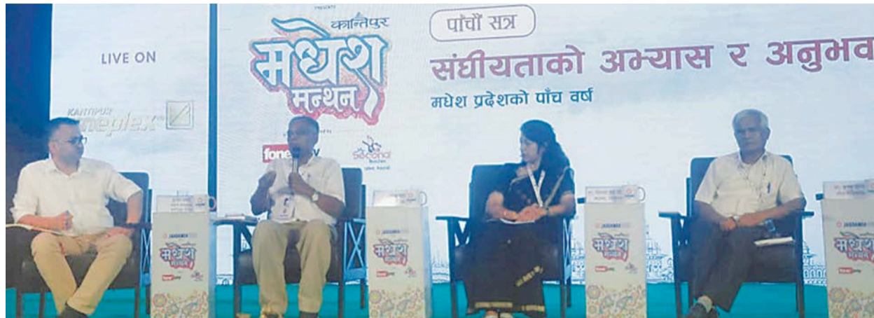
Some speakers argued that the constitution itself was designed so as not to give powers to the provinces.