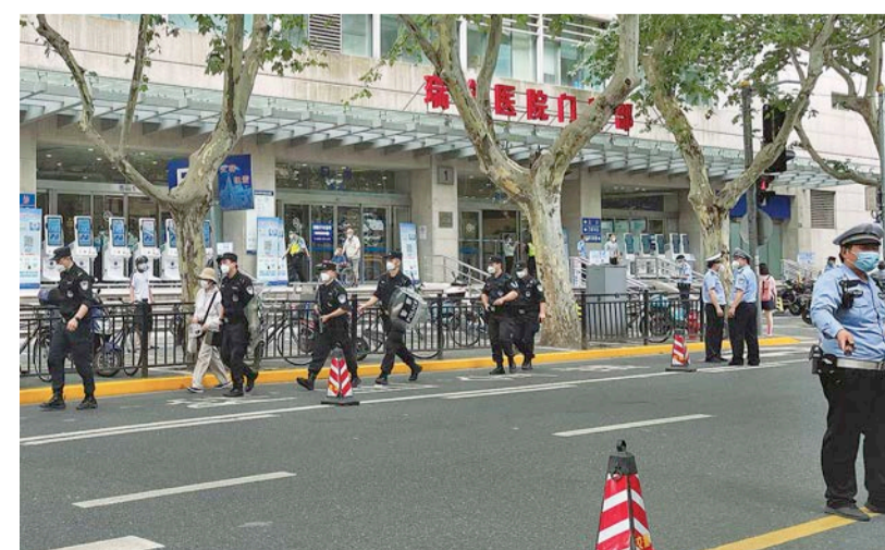
Police officers walk outside the outpatient department of Ruijin Hospital following a stabbing incident in Shanghai on Saturday.

"It's very shocking," said a Shanghai resident who had arrived for a check-up just after the hospital was sealed off, declining to give her name.