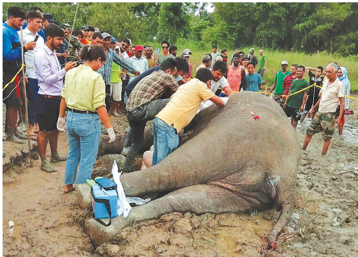
Park officials examine an elephant that was found dead near the Dahijhoda forest area of Arjunthara Municipality-4 in Jhapa on July 6.