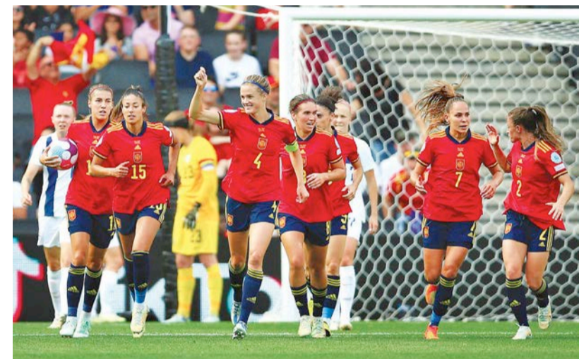
Spain's Irene Paredes (centre) celebrates scoring her side's first goal of the game during the Women's Euro 2022 match against Finland at the Stadium MK in Milton Keynes on Friday.