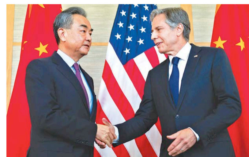
US Secretary of State Antony Blinken (right) shakes hands with China's Foreign Minister Wang Yi during a meeting in Nusa Dua on the Indonesian resort island of Bali on Saturday.

Just two days earlier, the countries' top military officers had faced off over Taiwan during a virtual meeting.