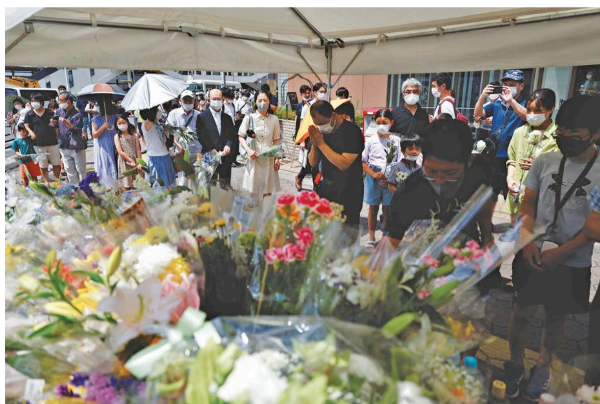
People queue up to offer flowers and pray at the site where late former Japanese prime minister Shinzo Abe was shot in Nara on Saturday.

A night vigil will be held tomorrow. Funeral will take place on Tuesday, attended by close friends, according to reports.