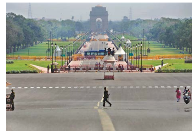
A paramilitary force soldier walks across Rajpath that was renamed Kartavya Path in New Delhi, on Sunday.