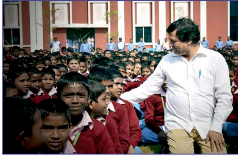
Bhubaneswar, Odisha, India.

deal with multilingual and multicultural classrooms effectively. Every year, the UNESCO International Literacy Prizes focus on a specific theme. This year, the spotlight was on Transforming Literacy Learning Spaces. KISS is the fifth institute from India and the first from Odisha to receive this international prize. It is also the third among the non-profit NGOs and first indigenous based organisation to be conferred with this award. KISS, the largest institute for the indigenous students in the world, is credited with the adoption of innovative pedagogies as learning tools and bringing about a perceptible change in the socio-economic lives of the indigenous population through education. This recognition also brings the state of Odisha to prominence on the world map for its efforts at changing the education ecosystem. Moreover, it is also a big day of celebration for indigenous communities as it is truly an award for them. KISS is a not-for-profit organisation headquartered in