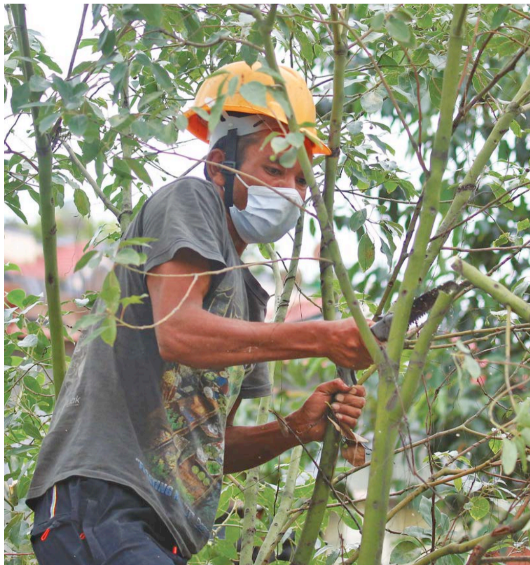
A man trims a roadside tree at Anamnagar in Kathmandu on Tuesday.

All Bids must be accompanied by a Bid Security.