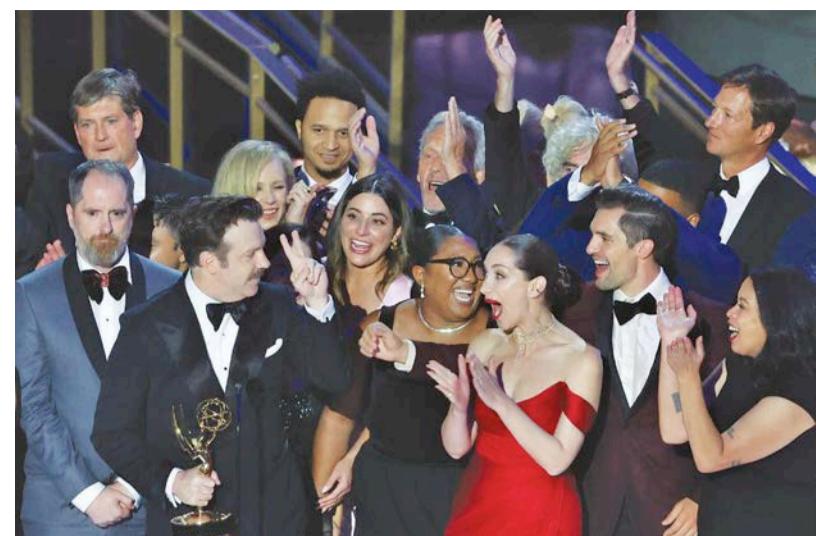
Jason Sudeikis accepts the award for Outstanding Comedy Series for 'Ted Lasso' at the 74th Primetime Emmy Awards in Los Angeles, on Monday.