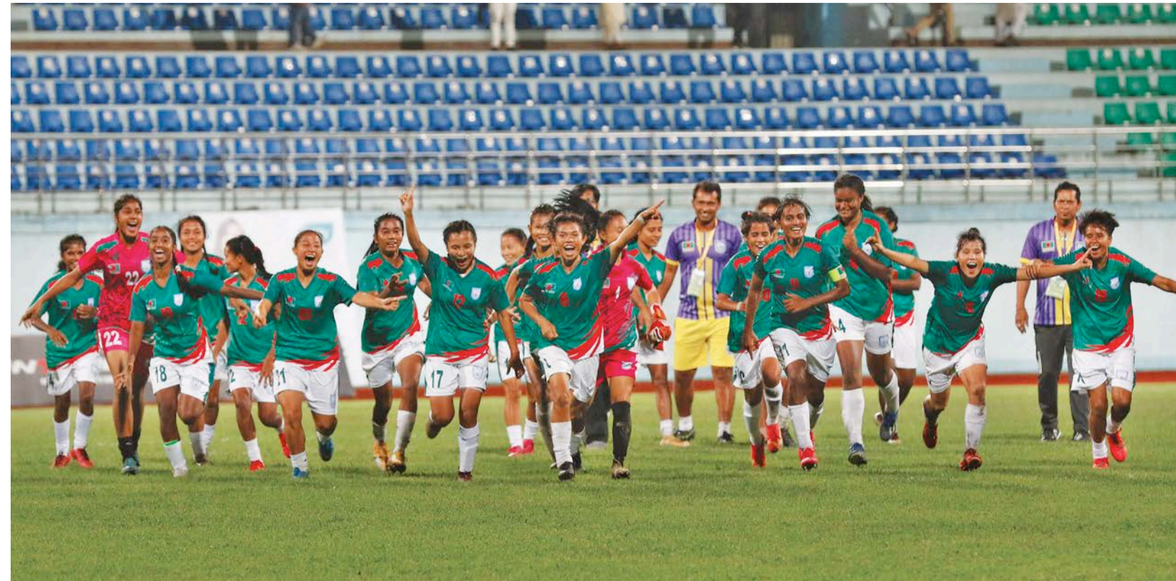
Players of Bangladesh celebrate after defeating India 3-0 in their SAFF Women's Championship 2022 Group 'A' football match at the Dasharath Stadium in Tripureshwar, Kathmandu on Tuesday. The outcome snapped India's 29-match unbeaten streak in the biennial competition.