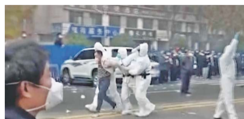
In this photo provided on Wednesday, security personnel in protective clothing were seen taking away a person during a protest at a Foxconn factory in Zhengzhou China.

Company says it is working with staff to resolve disputes.