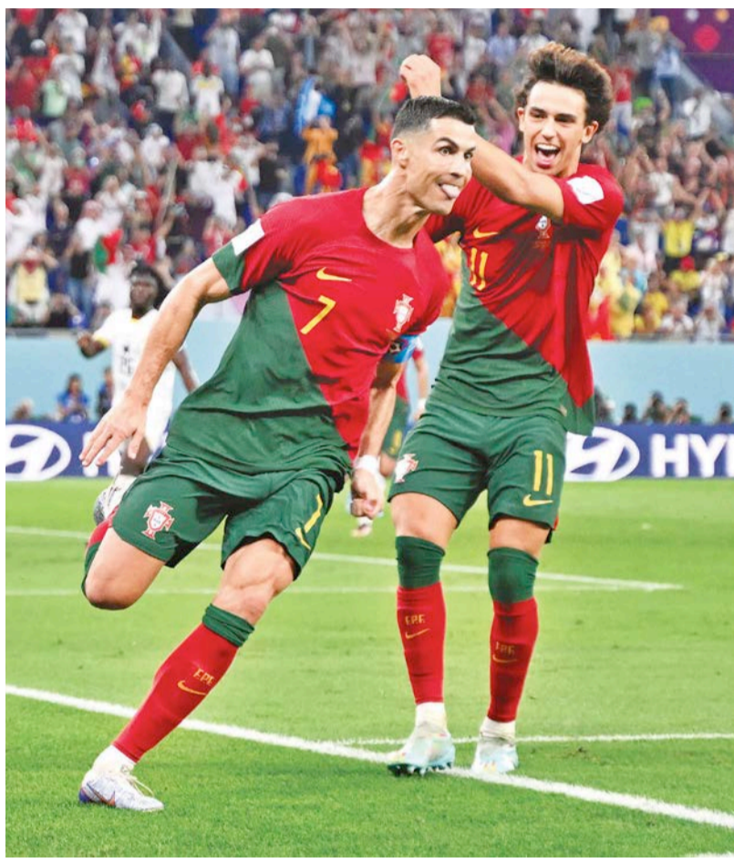
Cristiano Ronaldo overtakes Pele and Germans Uwe Seeler and Miroslav Klose, who all scored in four World Cups. Ronaldo also extended his own world record tally of international goals to 118.

Real Madrid midfielder Federico Valverde came closest to breaking the deadlock when hitting the woodwork in each half, while Hwang Ui-jo wasted Korea's best chance, skying a shot