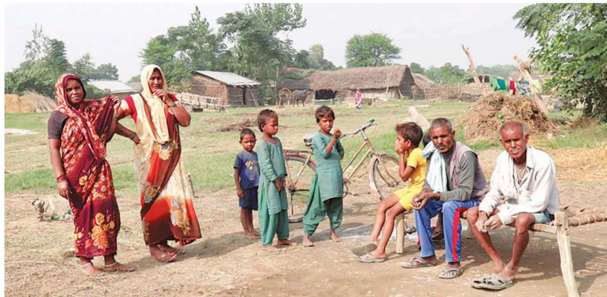
Residents of Ramnagar (pictured) in Banke say their village and adjoining Chaupheri were inundated by floods 55 times in the past 25 years.

The two villages suffer power cuts and a shortage of drinking water every monsoon. But even during the dry season, they don't live comfortably, say locals. "Our children remain out of school as there is none nearby and we succumb to minor ailments