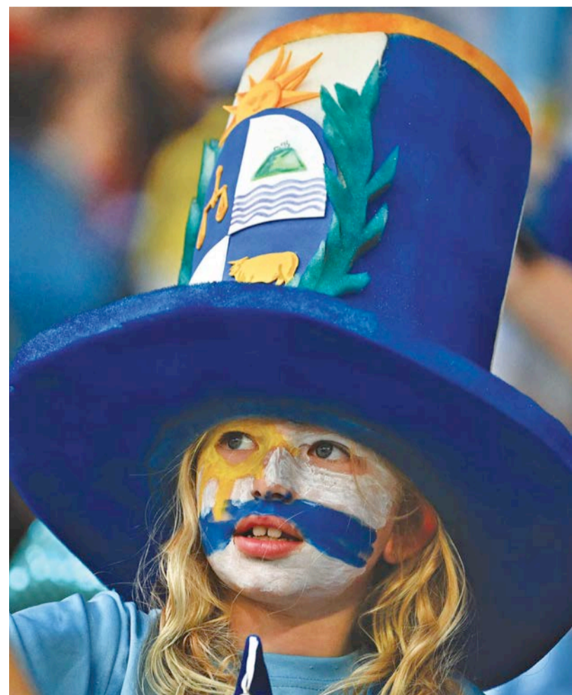
A Uruguay supporter waits for the start of the FIFA World Cup Qatar 2022 Group H football match between Uruguay and South Korea at the Education City Stadium in Doha on Thursday.