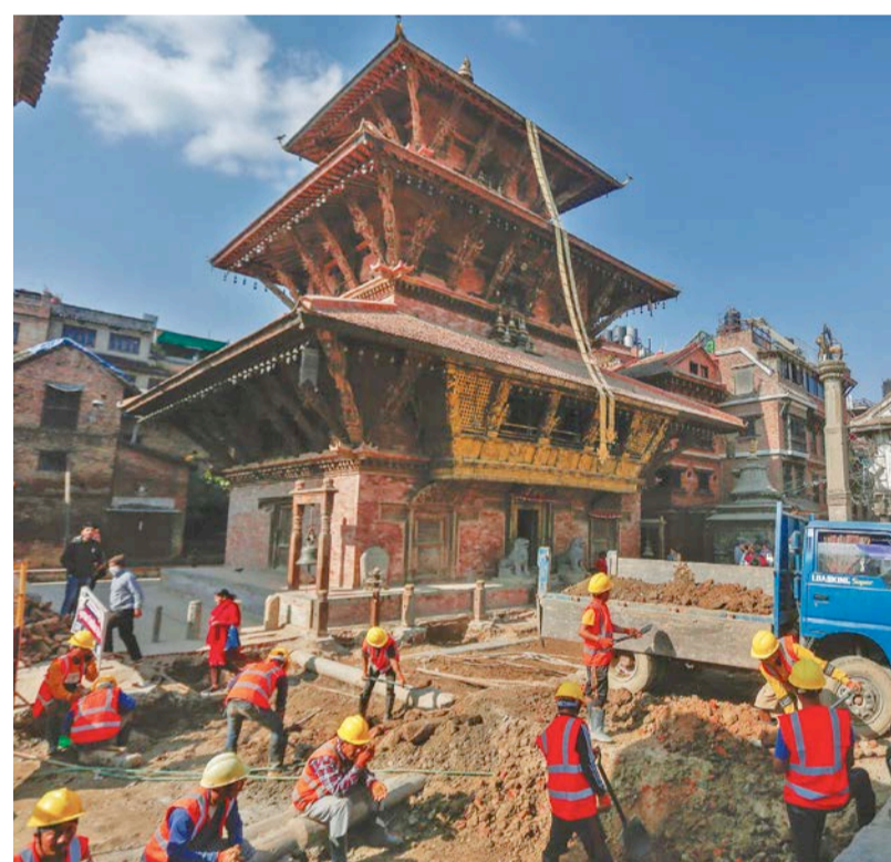
Workers load mud onto a truck at a construction site at Patan Durbar Square on Thursday.