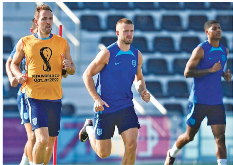
England's Harry Kane (left) trains at the Al Wakrah Sports Complex in Qatar on Thursday.

England hit six against Iran in their opening game but coach Southgate is concerned about the two they conceded.