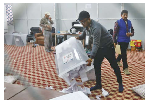
An election official empties a ballot box at International Conference Centre, Baneshwar in Kathmandu on Monday.

The body is studying the disputes and has announced re-polls at a centre in Bajura.