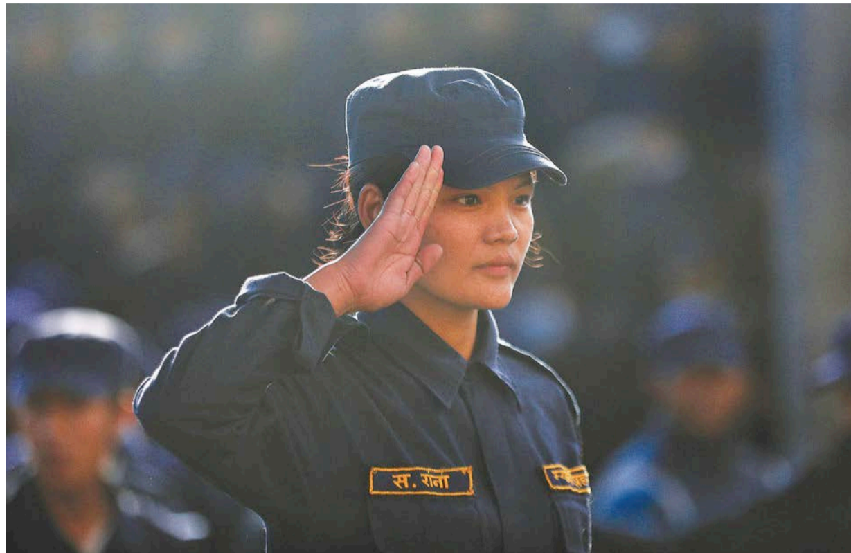
A temporary policewoman salutes during the recruits' farewell event at Jawalakhel in Lalitpur on Thursday. Around 115,000 personnel hired for a short term for the House of Representatives and provincial assembly elections held on November 20 have been relieved of duties.