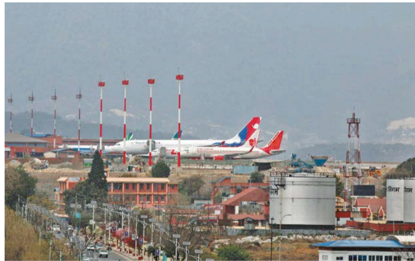
Global aviation watchdogs have questioned the civil aviation body's dual role and urged Nepal to split the organisation into two entities—service provider and regulator.

European Commission says no grounds for revising the list of carriers, including Nepal's, barred from serving the EU.