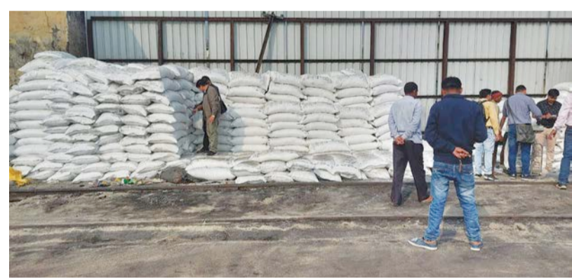
The fertiliser was supplied by Indian Potash Limited, a fertiliser company based in India.

As farmers rush to plant their winter crops—wheat, maize, mustard and pulses—with the chill setting in, several districts across the country are reporting shortages of chemical