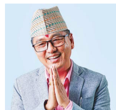
RPP chief Rajendra Lingden