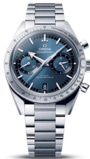
SPEEDMASTER '57 Co-Axial Master Chronometer

With its unique Broad Arrow hands and tachymeter scale on the bezel, the Speedmaster '57 is emblematic of the first, revolutionary Speedmaster that was launched in 1957. For the latest update, OMEGA has lifted the vintage spirit to another level, with slimmer styling, extraordinary colour, and a Co-Axial Master Chronometer engine that takes precision to the next gear. This enduring watch is a front seat companion for George Clooney, and represents the original, timeless look of the Speedmaster line.