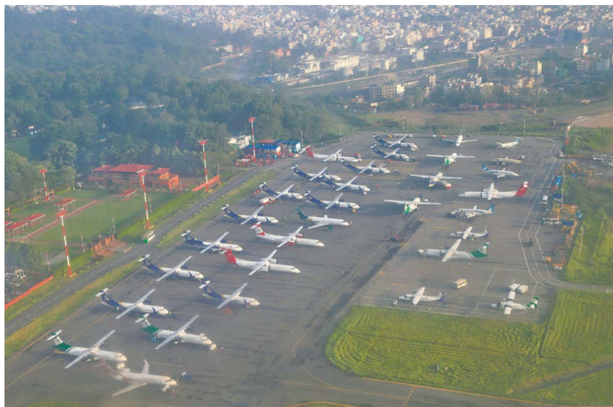
Several unnamed experts told the Post that the civil aviation body has been misusing its authority but no one wants to speak against it.

Following the September 2012 crash of Sita Air Flight 601 at the Manohara