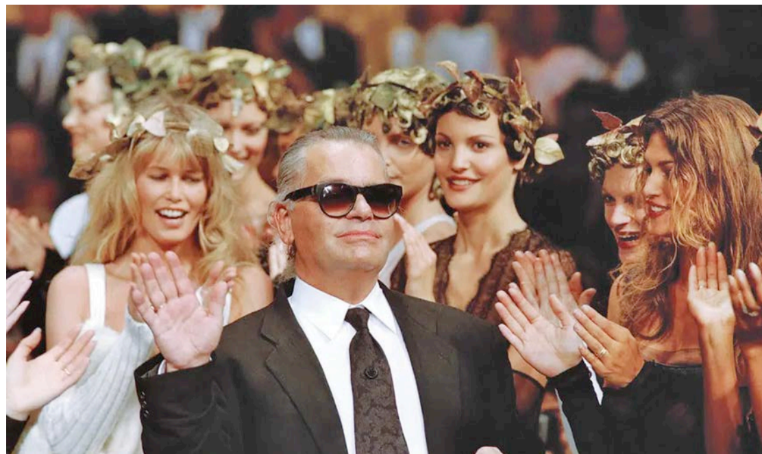
Lagerfeld acknowledges the applause of his models at the end of the Chanel Fall-Winter 93-94 haute couture collection in Paris.