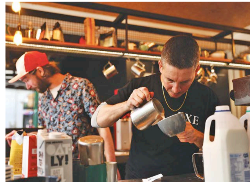
A file photo shows a barista preparing a coffee at a cafe in Sydney, Australia.

Australia, many of whom had become "permanently temporary migrants" living on various visas in the country for years, would be given clearer pathways to permanent residency by the end of the year, she said.