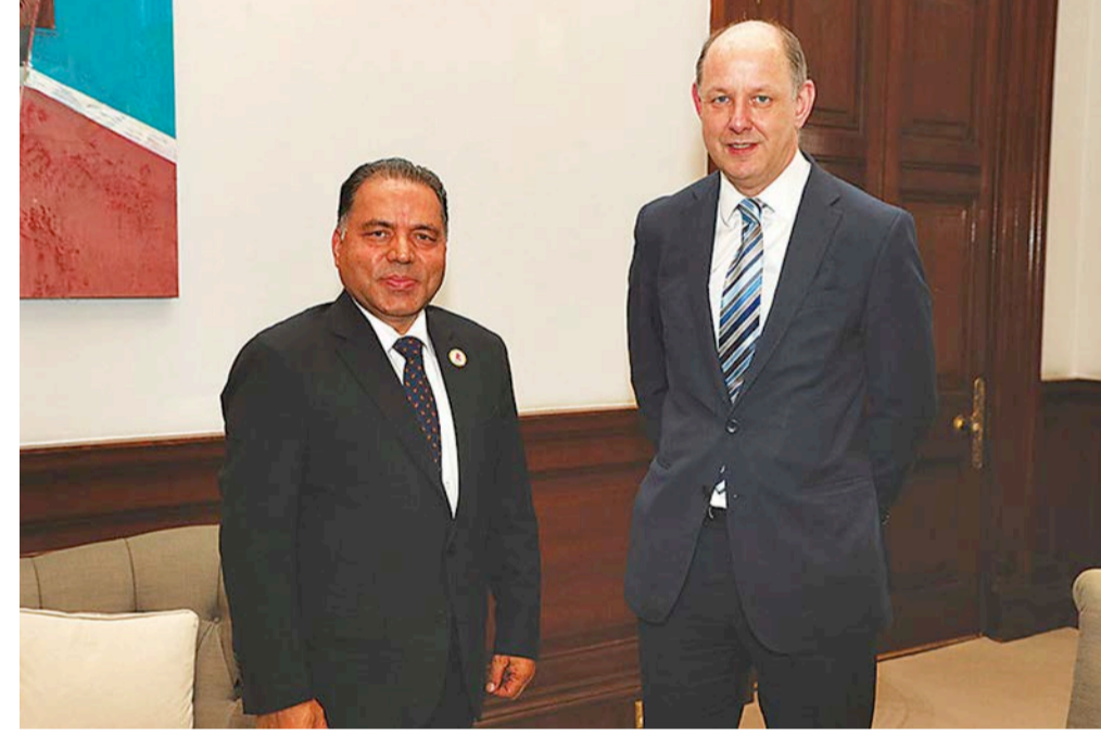
Foreign Secretary Bharat Raj Paudyal and the Permanent Under-secretary at the Foreign and Commonwealth Development Office Philip Barton led their respective delegations at the meeting.

The Nepali side lauded the valuable cooperation provided by the United Kingdom as one of the largest development partners and emphasised the need for continuity and enhancement of such support, the statement added.