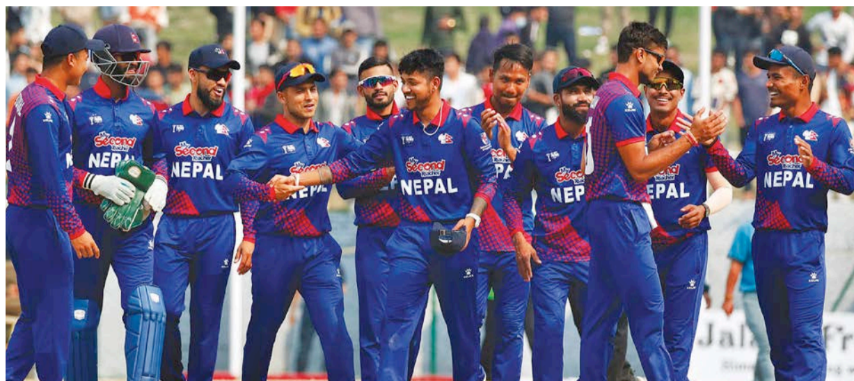
Nepal players celebrate after defeating Qatar during their ACC Men's Premier Cup Group A match at the TU Cricket Ground on Thursday.

In Group 'B', UAE secured the top spot, finishing on six points with three wins and a defeat and will now meet the Group 'A' runner up, Oman. Kuwait, which also wrapped up on six points, finished second on net run