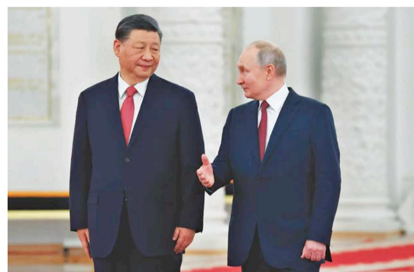
A file photo shows Russian President Vladimir Putin (right) speaking to Chinese President Xi Jinping at The Grand Kremlin Palace, in Moscow, Russia.

The announcement gives Beijing a chance to show it doesn't always agree with Moscow, though the differences might be too subtle for Western critics. They complain China helps Putin resist Western sanctions by purchasing Russian oil and gas and provides