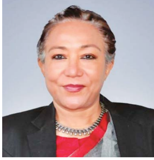
Justice Sapana Pradhan Malla