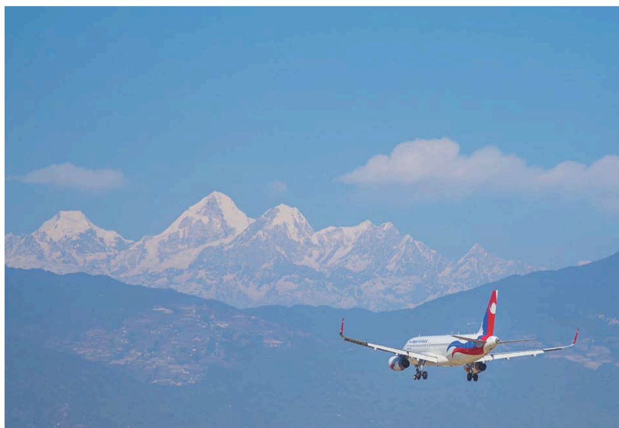
Kathmandu is Sydney's largest unserved market, with over 100,000 people travelling between Nepal's capital and Australia's largest city annually.

According to the Australian Bureau of Statistics, 129,870 Nepalese-born people were living in Australia at the end of June 2021, almost five times the