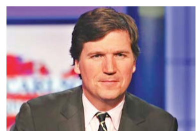
A file photo of Tucker Carlson.