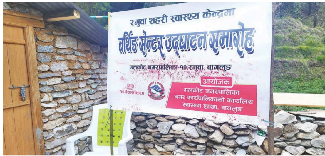
The urban health unit and birthing centre at Ramuwa of Pandavkhani in ward 10 of Galkot Municipality.