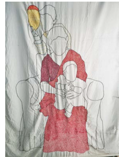
An artwork from the 'Absence Unbothered' series.