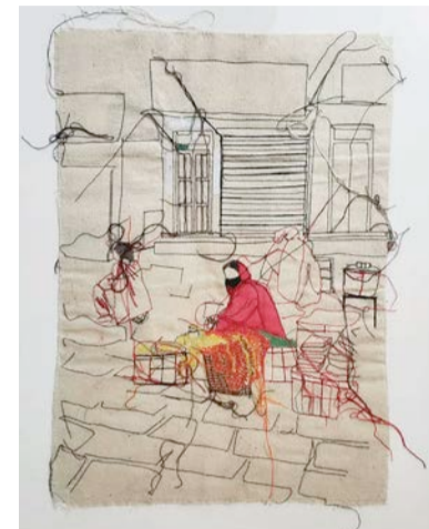
'Market II' from her series 'A Small Walk'.