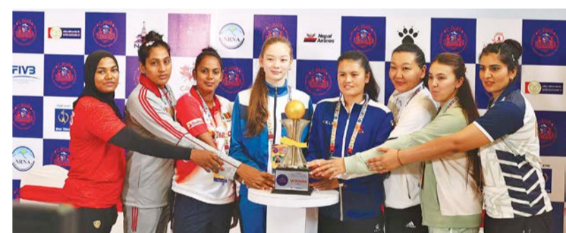
Captains of all eight participating teams of CAVA Women's Volleyball Challenge Cup during a trophy unveiling ceremony in Tripureshwar, Kathmandu, on Sunday.

Nepal will play their second game against Bangladesh on Tuesday and India the following day before wrapping up the league stage.