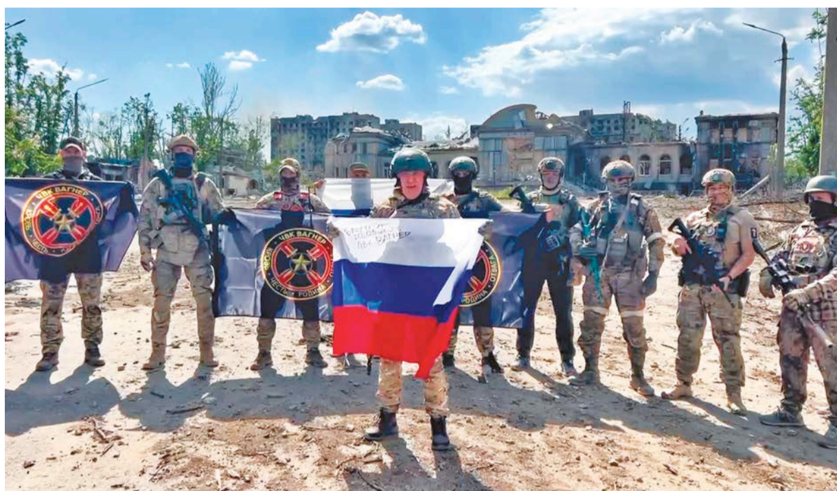
In this handout photo taken from video and released by Prigozhin Press Service on Saturday, Yevgeny Prigozhin, the head of the Wagner Group military company, speaks holding a Russian national flag in front of his soldiers in Bakhmut, Ukraine.

Only hours earlier, Russian state news agencies reported that President