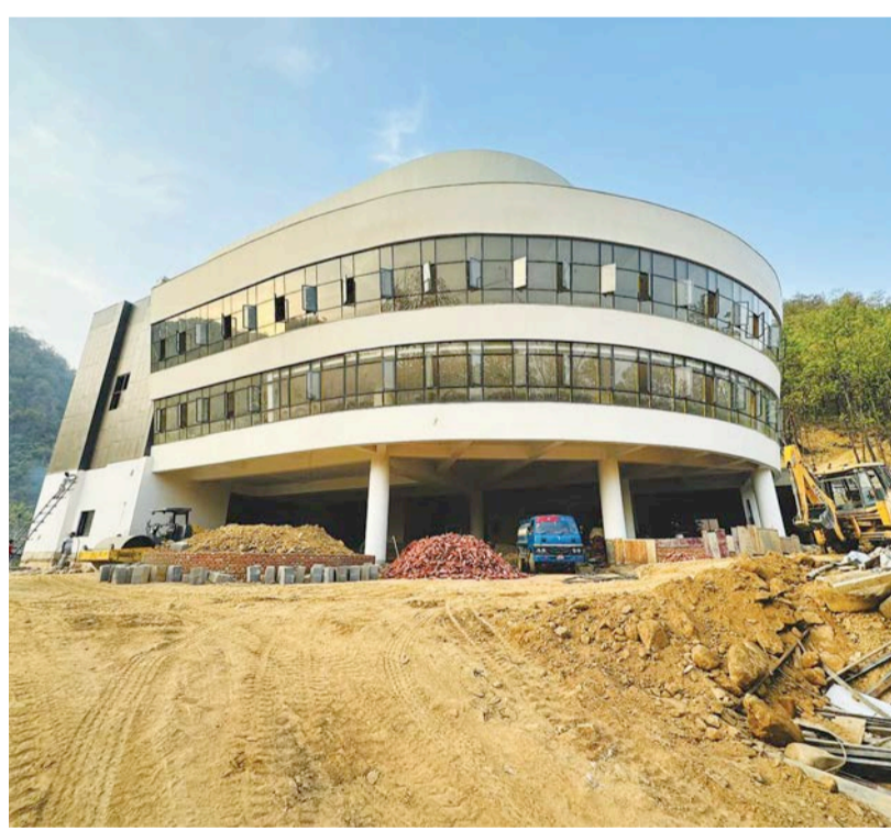
The cable car, which will operate under a single detachable gondola system, will transport 6,000 passengers daily in 24 gondolas, with a capacity of eight persons per gondola.

Bamghat, where the Lumbini cable car base station is located, is the confluence of the Terai and the hills. Bamghat, which is at the foot of the hill, is at a distance of 29 km from the Belahiya border point. From Belahiya, the Gorakhpur town in India is 174 km away. The heat reaches its peak from April to September in India,