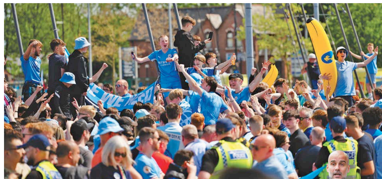
Supporters of Manchester City celebrate their Premier League triumph prior to their match against Chelsea at the Etihad Stadium in Manchester on Sunday.

Guardiola's men turn the world's richest league into a one-horse race having clinched fifth title in six seasons, raising questions over the competitiveness of the English top flight.