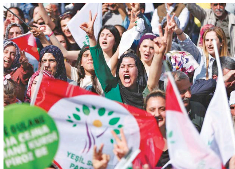
A file photo shows pro-Kurdish Green Left Party supporters in Diyarbakir, Turkey.

But after a ceasefire collapsed in 2015, he changed course, with the