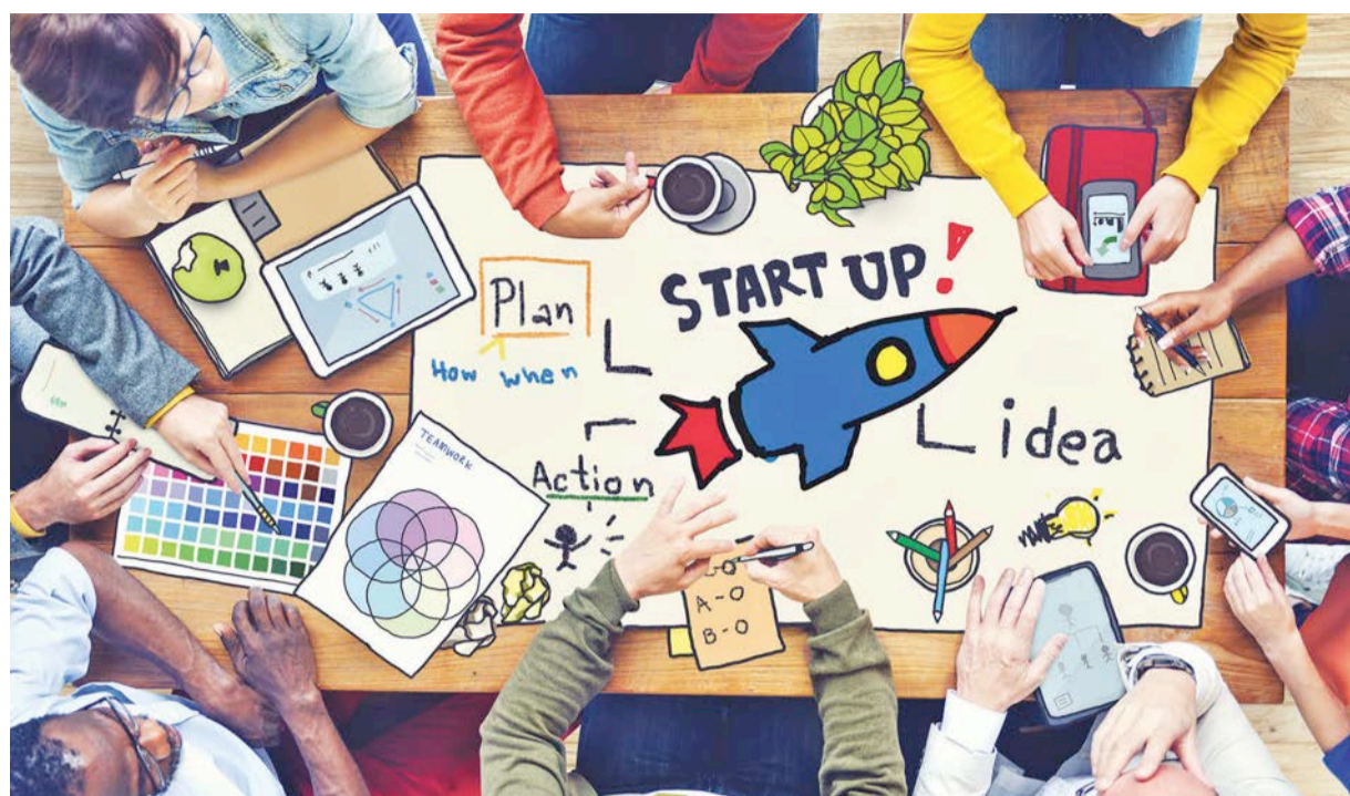
Some startup entrepreneurs who applied for the subsidised loan said they never received the money, alleging that while such a scheme is announced every year, it never really materialises.

the allocation of human resources with the Ministry of Industry, Commerce and Supplies for a temporary period to fast-track the process.