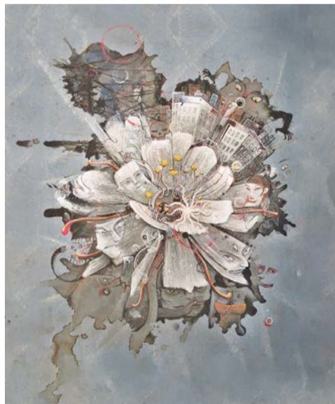
Album cover for 'Raat Ko Rani'

Art without an audience is incomplete. To be relevant and relatable to fans is their biggest achievement.