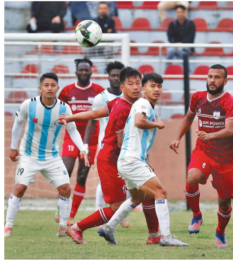
Players of Manang Marshyangdi Club and Church Boys United (red) compete during the Martyrs Memorial A-Division League at the Chyasal Stadium in Lalitpur on Thursday.