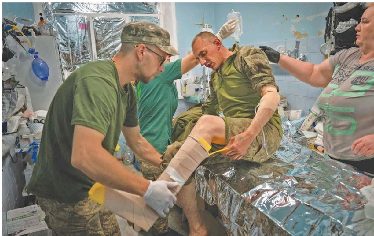
Medics give first aid to wounded Ukrainian soldiers at a medical stabilisation point near Bakhmut, Donetsk region, Ukraine on Wednesday.

Top Ukrainian presidential adviser Mykhailo Podolyak said on Thursday that Ukraine's counteroffensive was already underway.