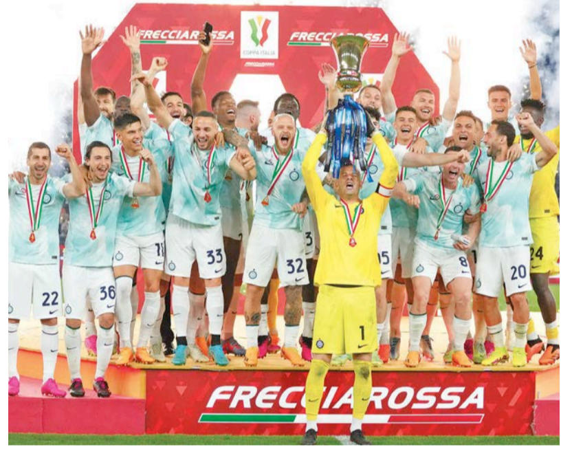
Inter Milan fought back to defeat Fiorentina 2-1 and win their second consecutive Italian Cup title at the Stadio Olimpico in Rome on Wednesday.

"We were hoping for a different result but this will serve as experience and preparation for what to expect on a mental level and how to handle the match for the Conference League final," Fiorentina coach Vincenzo Italiano said. "It's the ninth Italian Cup title for Inter, while Nerazzurri coach Simone Inzaghi has now won seven of his eight finals as a manager. "We started poorly and had the wrong approach, which is rare for us, but the guys did well to stay in the game anyhow and then turn it around," Inzaghi said. "The team are improving match by match."