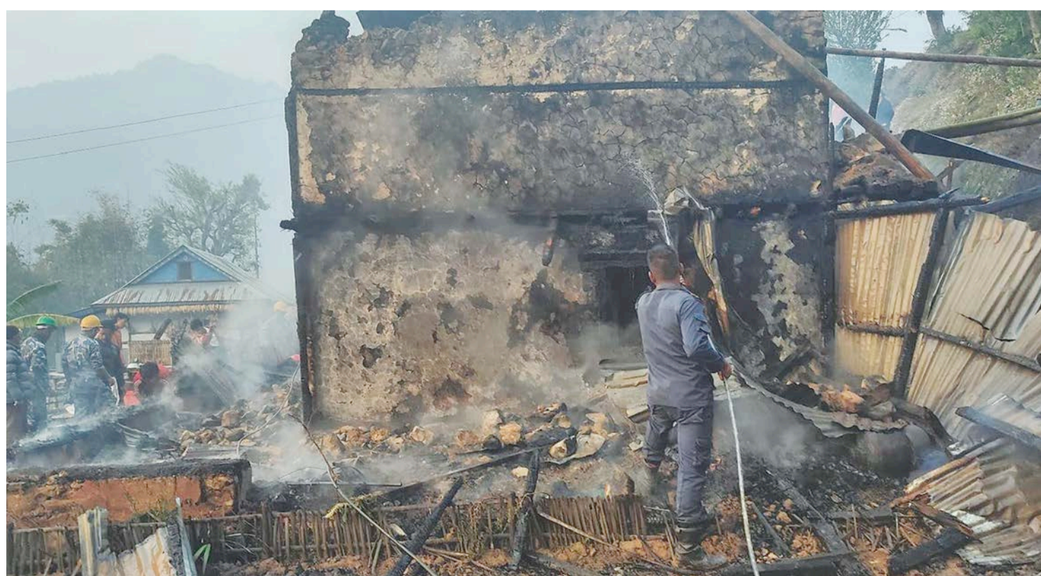
Police and locals battling a fire in a village in Panchthar district in this recent photo. Forest fires are increasingly threatening settlements in many hill districts in recent years.

These are some representative cases of fire that destroyed lives and properties in various eastern hill districts of Koshi Province. Fire incidents, both house fires and wildfires, cause a huge loss of lives and properties in Panchthar, Ilam, Taplejung, Sankhuwasabha, Dhankuta, Khotang, Tehrathum, Okhaldhunga and Bhojpur districts each year. A total of 842 incidents of fire were reported in Koshi Province over the past eight months, killing 15 people and injuring many others. According to records at the Provincial Police Office, fire destroyed a total of 445 houses and 182 sheds, displacing at least 141 families in the prov-