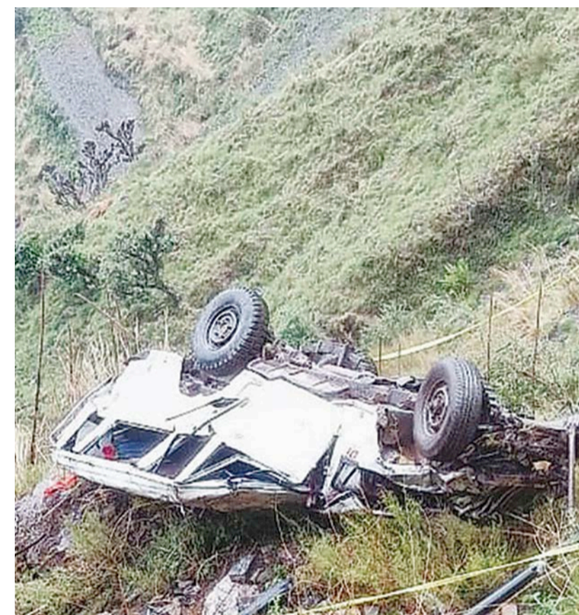
The mangled jeep after Thursday's accident.

According to the data of the district police office, in the last two years, 35 people have died and 16 people have been injured in road accidents in the district.