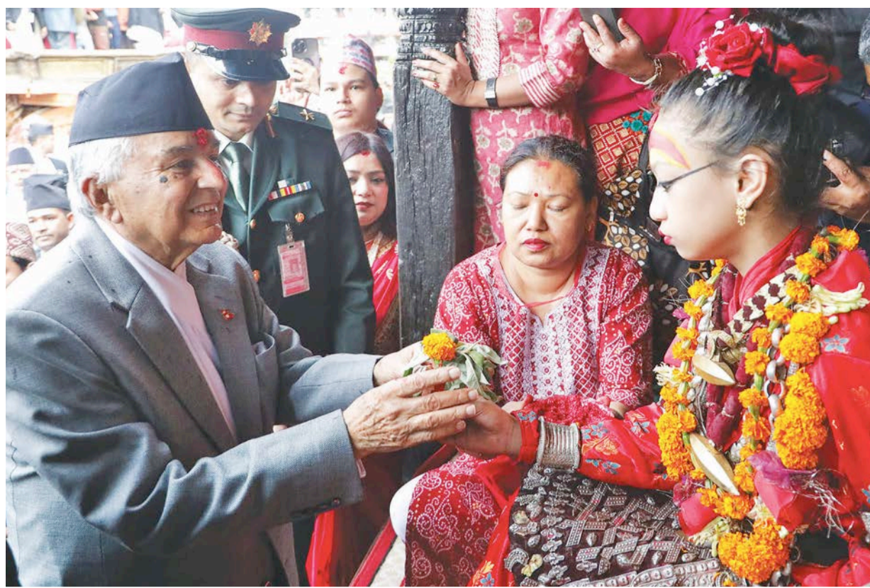
President Ramchandra Paudel receives blessings from Living Goddess Kumari after observing the Bhoto Jatra festival at Jawalakhel in Lalitpur on Thursday afternoon. Bhoto Jatra marks the culmination of the weeks-long Rato Machhindranath chariot festival.