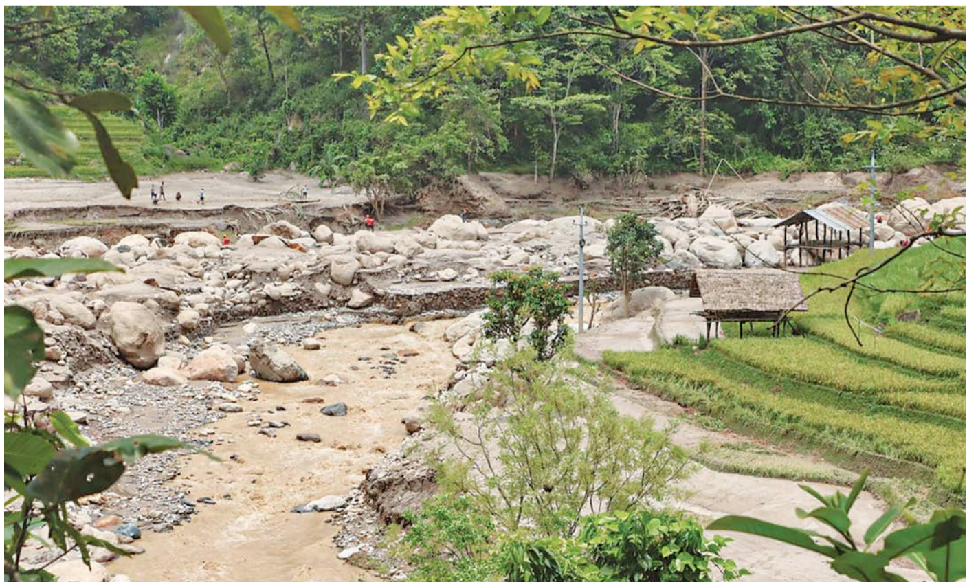
The massive flooding of the Hewa Khola in Sankhuwasabha district on Saturday has dumped landslide debris on the paddy fields at Paanchkhanan Municipality. This picture was taken on Tuesday. Five people have been confirmed dead and 26 are missing in Saturday's floods and landslides in three hill districts of east Nepal.

A medical team in Janakpur Provincial Hospital carried out a post-mortem of the deceased on May 22. The postmortem report says that the victim died by hanging and it could be a suicide. The report mentions that the victim sustained deep injuries on her cheek.