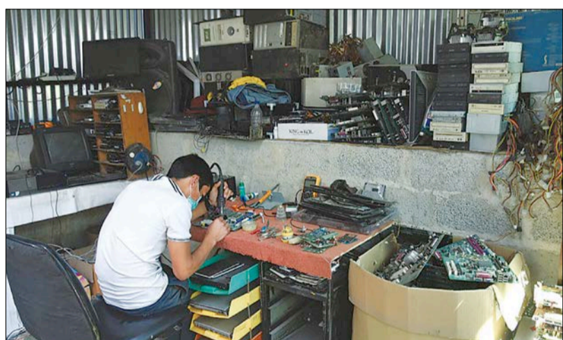
POST FILE PHOTO

CRT monitors account for 40 percent, mobile phones 39 percent and refrigerators 16 percent of the total e-waste.