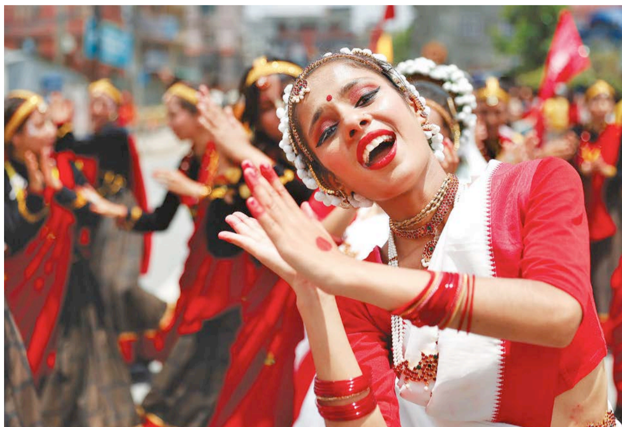
Devotees sing and dance during Jagannah Jatra at Bhrikutimandap in Kathmandu on Tuesday.