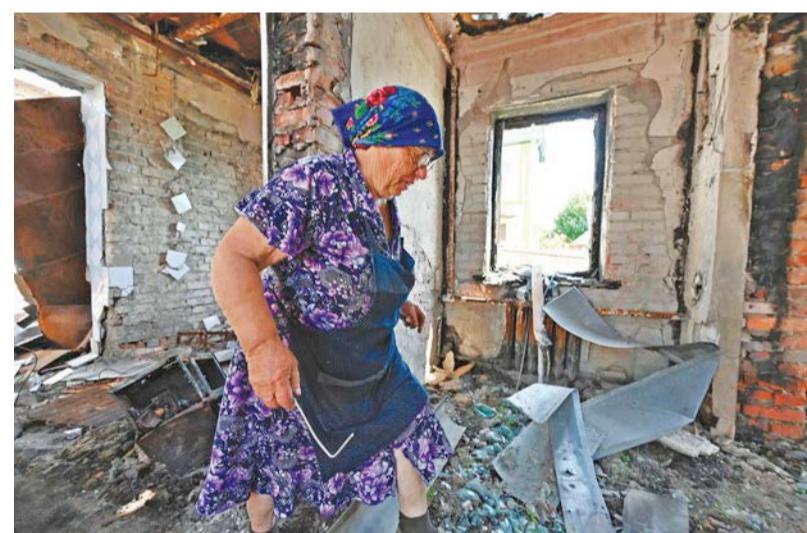
A local resident walks among remains of her house in the village of Rus'ka Lozova, Kharkiv.

Russian drone footage appeared to show several German-built Leopard mine-clearing tanks and US-made Bradley fighting vehicles damaged.