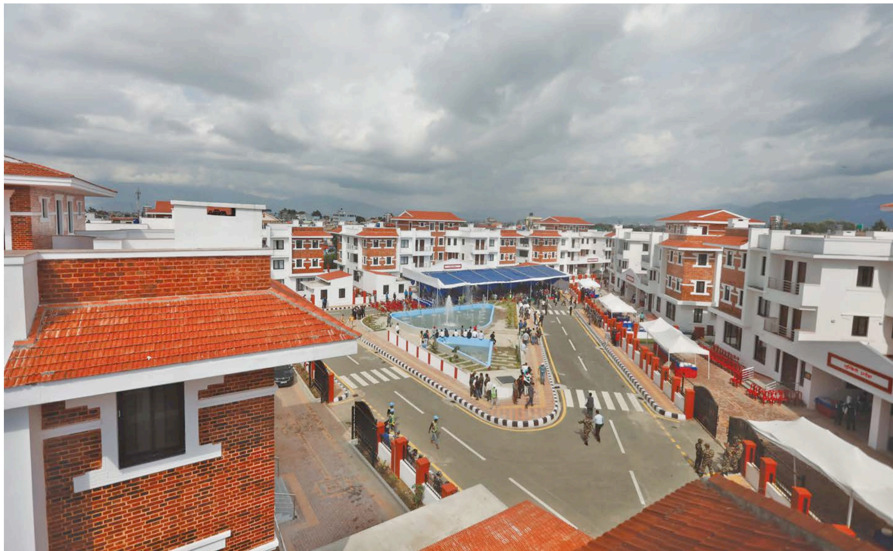
A view of the residences at Bhainsepati in Lalitpur that Prime Minister Pushpa Kamal Dahal handed over to the province heads and chief ministers on Sunday.

The app, developed with the technical support of the United States Agency for International Development, enables access to information about health and nutrition service delivery points in their surroundings in Nepal.