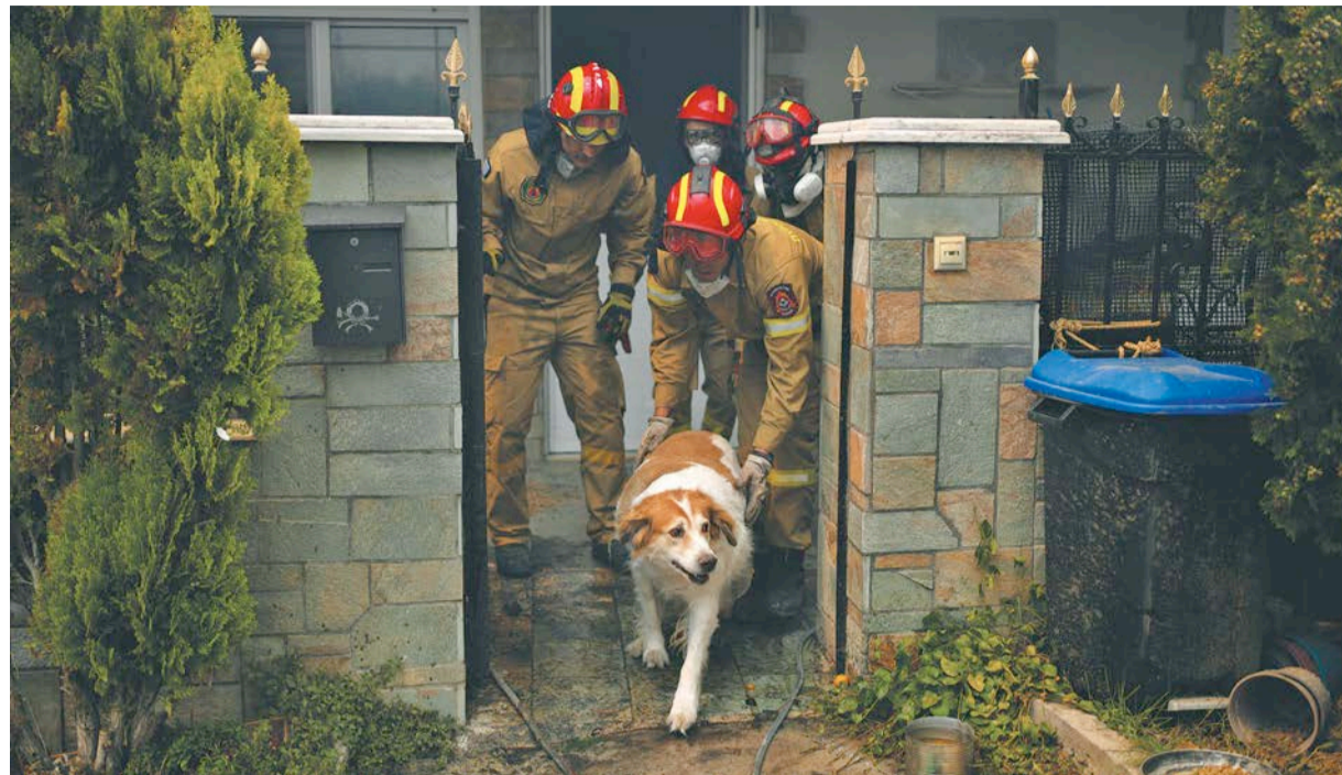
A file photo shows firefighters evacuating a dog from a house during a wildfire in Acharnes a suburb of northern Athens, Greece.

A third major wildfire started on Saturday on the Cycladic island of Andros and was still burning out of control Sunday, with 73 firefighters, two planes and two helicopters dousing the blaze. Lightning strikes are suspected of having sparked that wildfire.