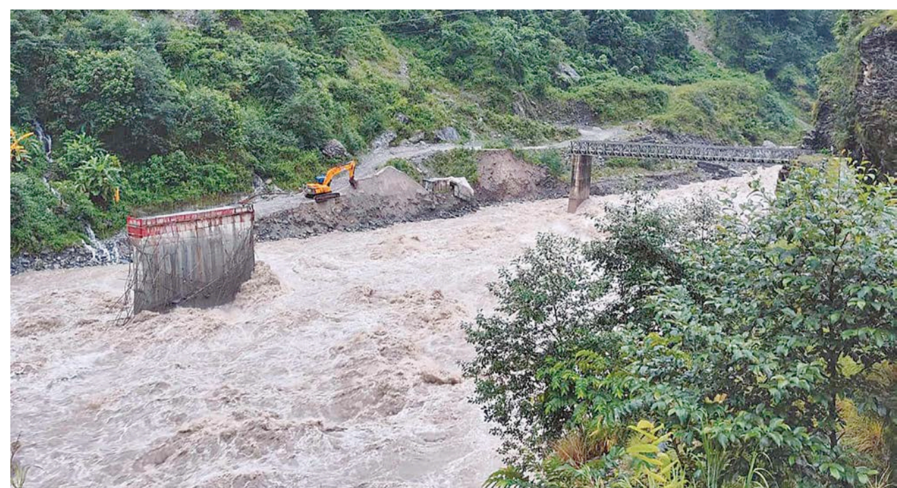
A damaged Bailey bridge at Diphlight in Solukhumbu. The link between Thulung Dudhkoshi 7 and Sotang 1 wards has been cut off by recent floods.

The UN health agency recommends less than two grams of sodium or five grams of salt per day for adults to reduce blood pressure, and cut the risks of cardiovascular diseases and stroke. It also recommends policies to reduce salt intake, including food product reformulation, establishing a supportive environment in public institutions, organising communications and mass media campaigns, and front-of-pack labelling to prevent and control non-communicable diseases.