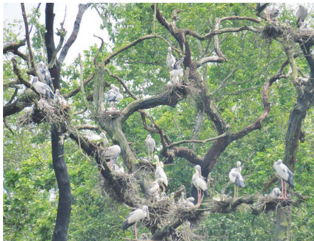
Dozens of openbill storks perched alongside their nests and chicks on a dead sal tree on the Batuli Pokhari lake in Chitwan pictured on Saturday. (Right) A close-up of an openbill stork tending to its chicks at the same location.

They arrive at Batuli Pokhari in the buffer zone of the Chitwan National Park at the start of summer, hatch eggs, raise chicks and leave before the winter.