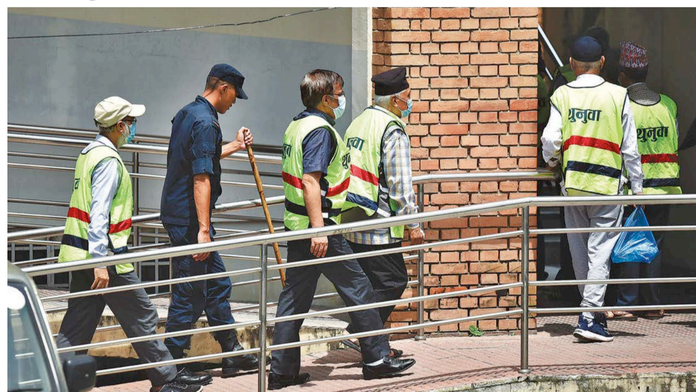
Those detained in connection with the Lalita Niwas land scam, donning high-visibility jackets, being produced at the Kathmandu District Court on Sunday.