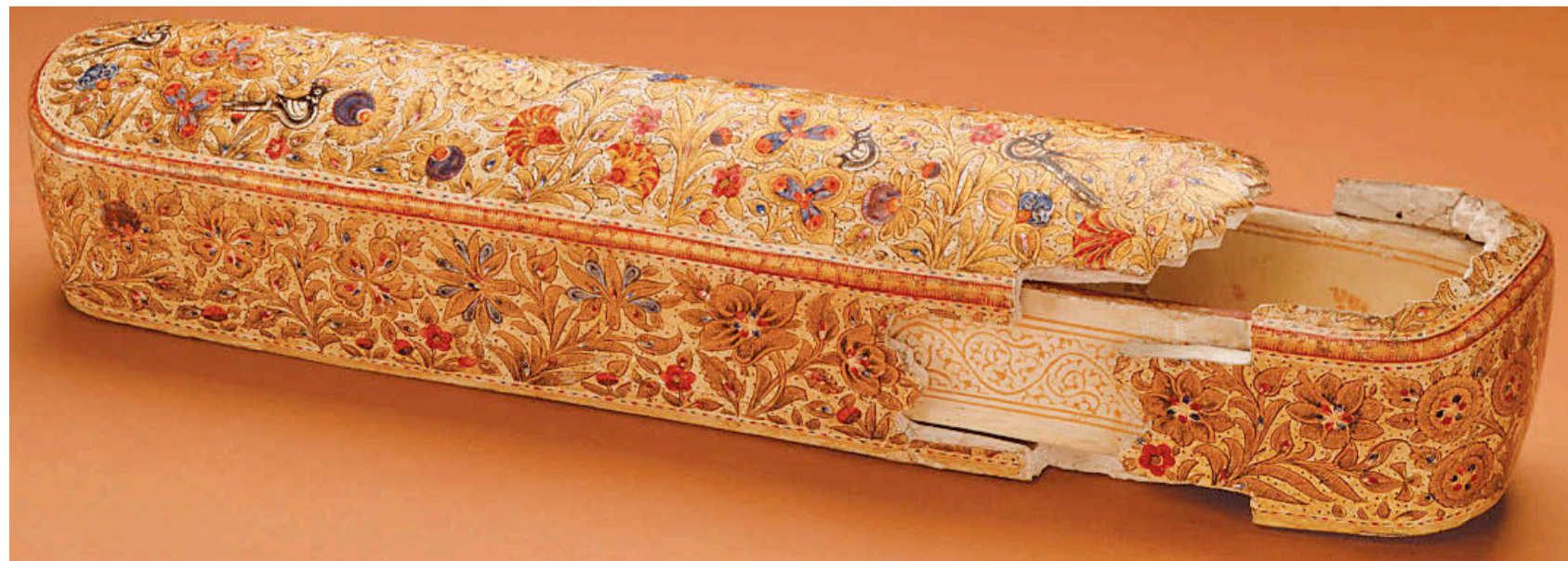
Papier-mâché with paint and gold leaf.

Published in special arrangement with TheWire.in