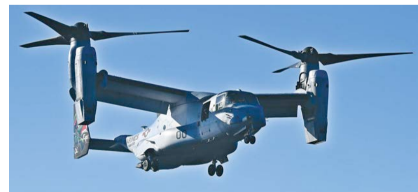
A file photo shows the MV-22B Osprey off the coast of Brisbane.

One of the injured was undergoing surgery at the Royal Darwin Hospital, Northern Territory Chief Minister Natasha Fyles said around six hours after the crash.