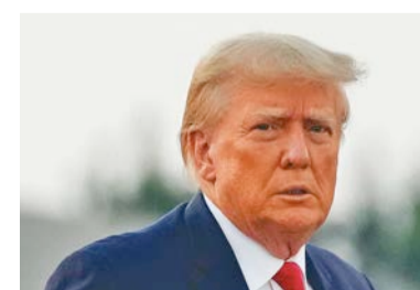
Former President Donald Trump.

ance on Thursday as a "terrible experience" and said posing for the historic mug shot was "not a comfortable feeling," his campaign immediately seized on its fundraising power.