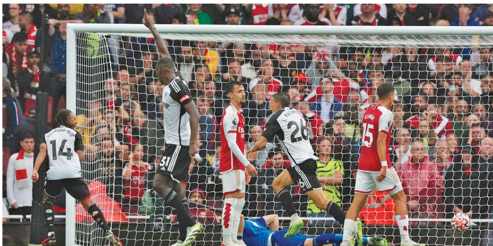
Arsenal are the first Premier League team to concede a first-minute goal three times in a calendar year.

Nepal are pitted against India and Pakistan in Group A. Sri Lanka, Bangladesh and Afghanistan are in Group B.