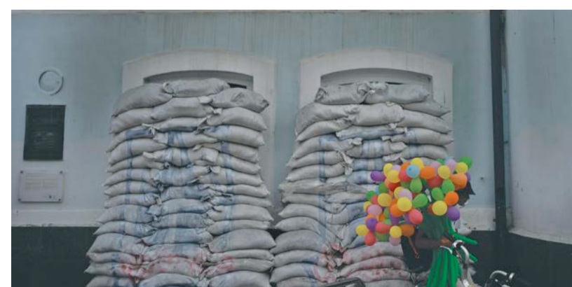
A man sells balloons next to piles of sandbags in Kyiv, Ukraine on Saturday.

Ukraine's Vasiliv tactical aviation brigade on Sunday identified the other