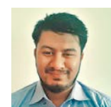
Tandukar is an organisational psychologist at Happy Minds, a mental health and well-being platform.

Instant gratification is undoubtedly appealing, but the better we can control our impulses and actions, the more rational our decisions become. This control empowers us to make choices based on our goals rather than being dictated by immediate circumstances. It's worth reflecting on whether we're in control of our actions or if our actions are in control of us.