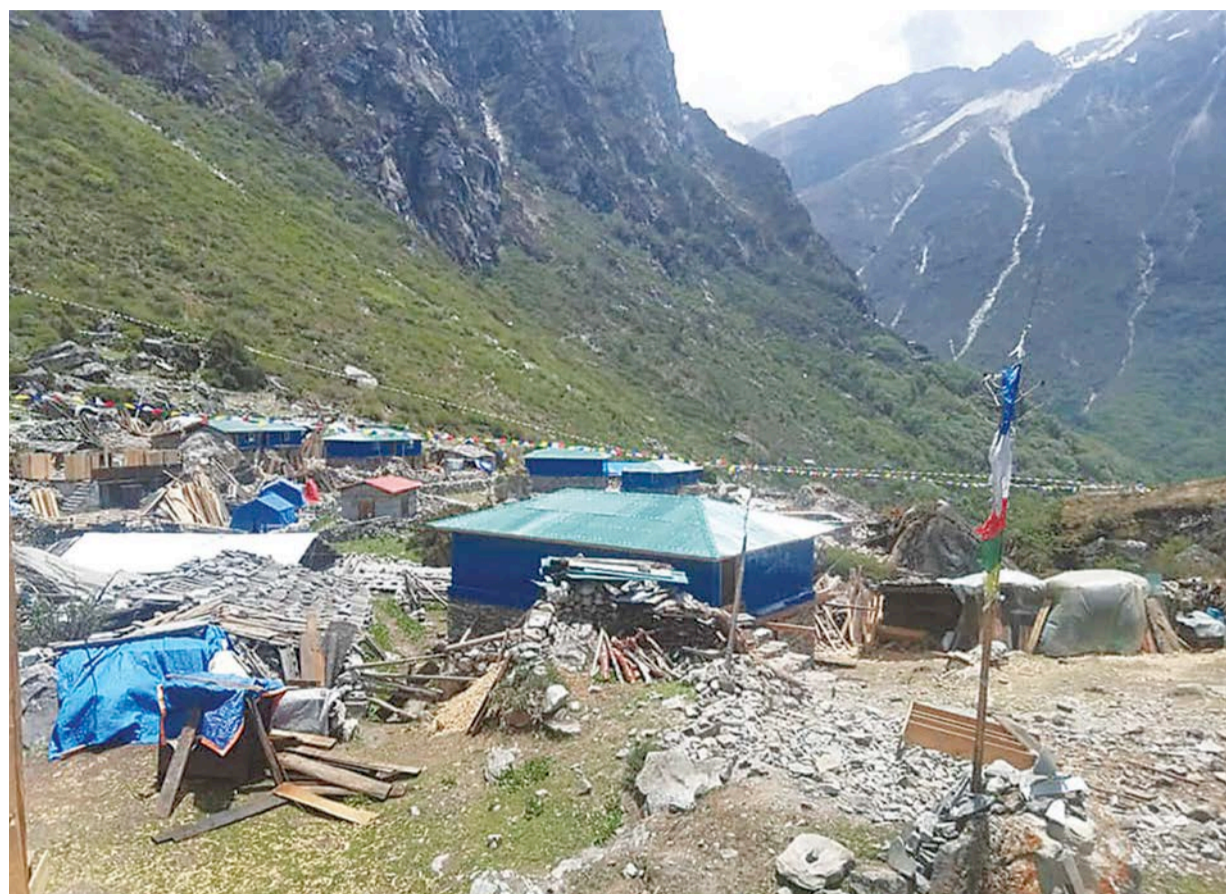
The Lapchi village near the Nepal-Tibet border pictured a few weeks ago. Many residents have left the village after they were unable to ply their traditional trade following the closure of the border three years ago. The Nepal-China border, which was closed at the start of the Covid pandemic four years ago, has yet to reopen.

The local residents have been forced to walk for two days to reach Lamabagar in Bigu-1 to buy daily consumables which they would otherwise buy in the Tibetan market across the border. "Now we have to pay Rs140 per kg of goods we transport to the vil-