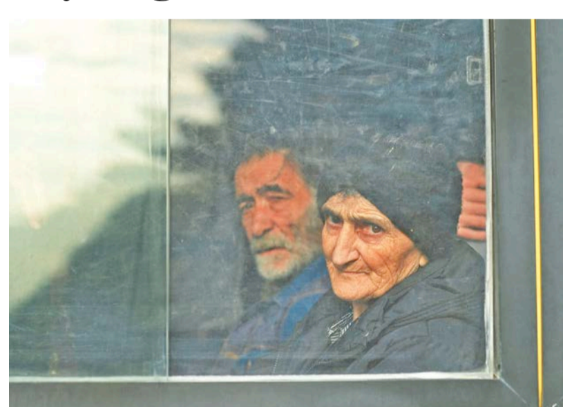
Residents sit inside a bus in central Stepanakert before leaving Nagorno-Karabakh, a region inhabited by ethnic Armenians on Monday.

The first two vessels carrying grain to use the corridor left the Black Sea port of Chornomorsk last week.