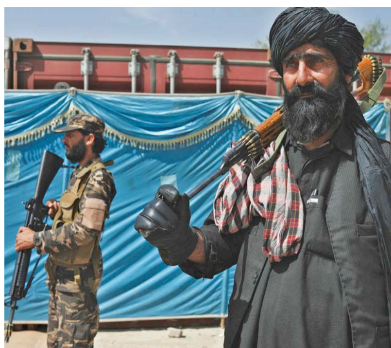
A file photo shows Taliban fighters standing guard in Kabul, Afghanistan.

It's the latest flare-up in long-simmering territorial disputes in the