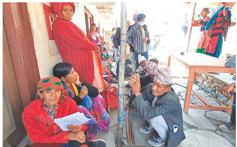
Elderly men and women wait outside a bank in Bajura to collect social security allowance.

Mounting cost raises concern about scheme's sustainability.