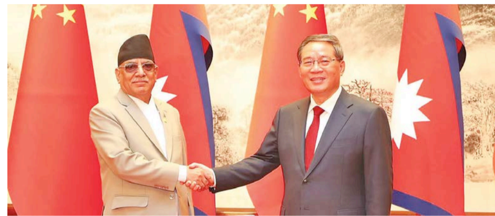
Prime Minister Pushpa Kamal Dahal (left) with his Chinese counterpart Li Qiang.