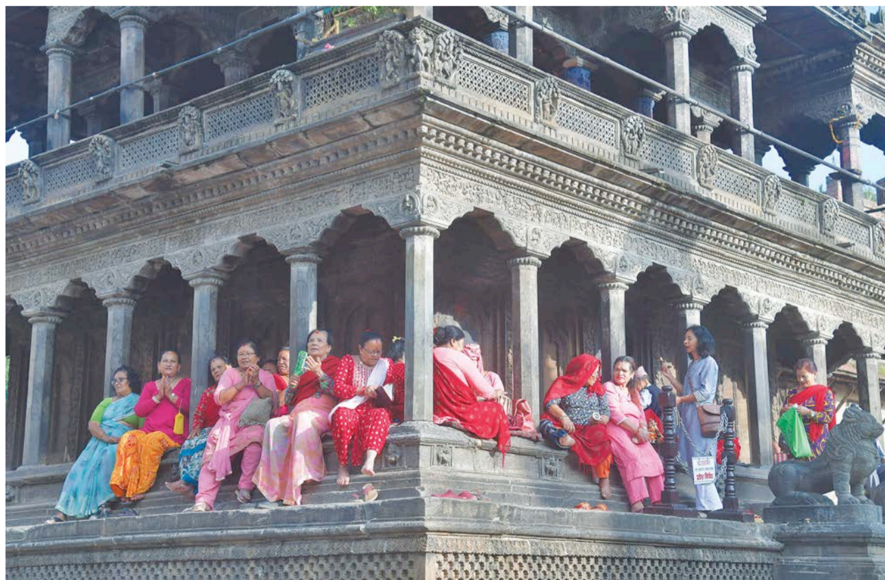
Devotees chant bhajans at Krishna Mandir in Patan, Lalitpur, recently.

HIMALAYAN ESSENCE ईमेल: info@himalayanesence.com.np सम्पर्क नं: +९७७ ९८०२३२७८५४