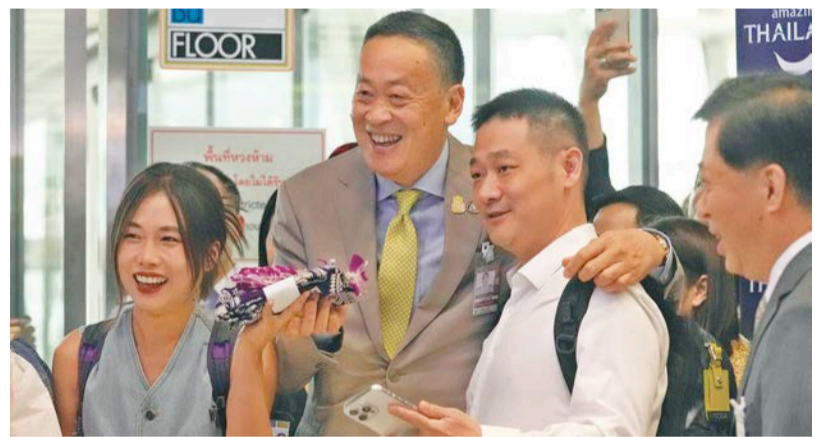
Chinese tourists takes picture with Thailand's Prime Minister Srettha Thavisin (centre) on their arrivals at Suvarnabhumi International Airport in Thailand on Monday.