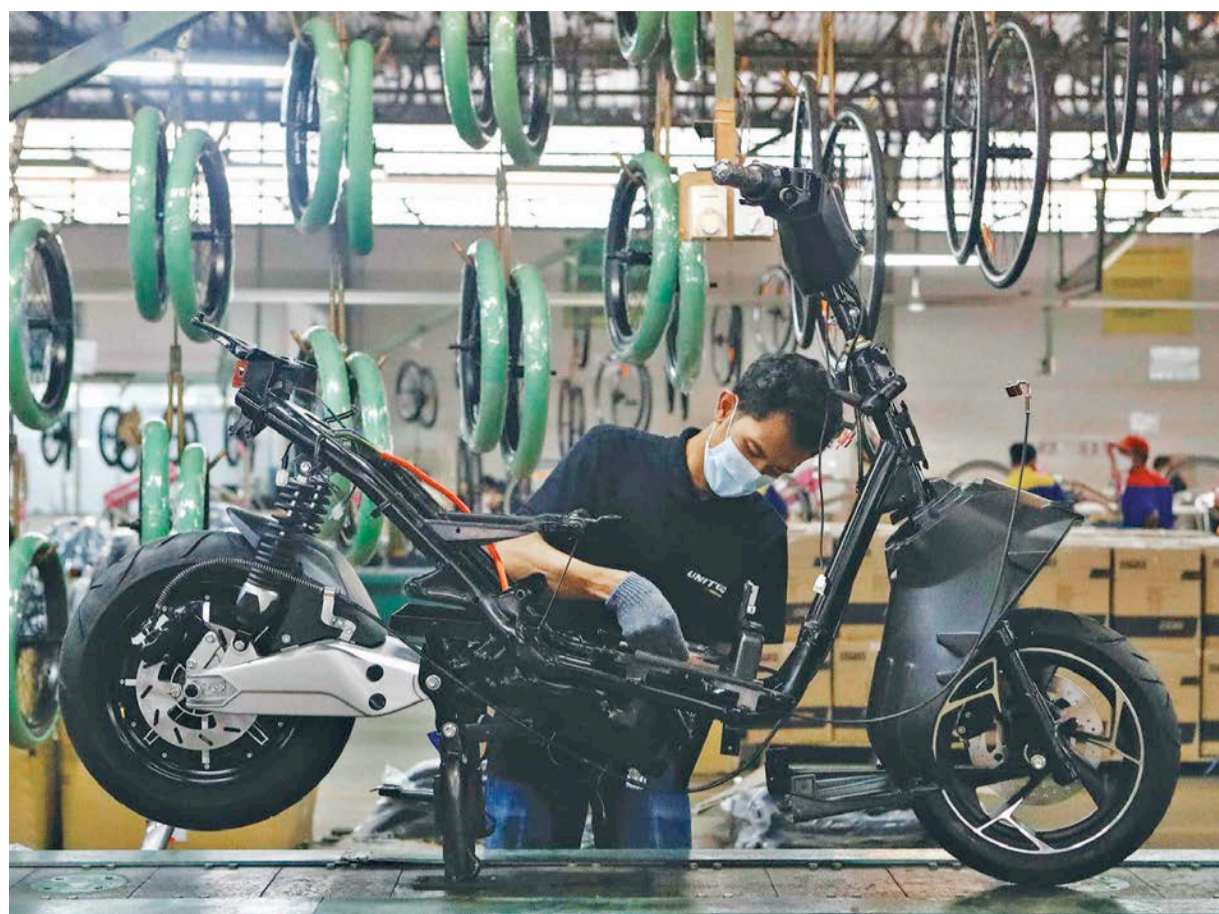
A file photo shows a worker at the assembly line of an electric motorcycle at a factory in Bogor, near Jakarta, Indonesia.

plan to open an electric two- and three-wheeler plant in Lalitpur with an investment of Rs200 million. They have proposed to build 3,500 scooters and 3,000 rickshaws annually.