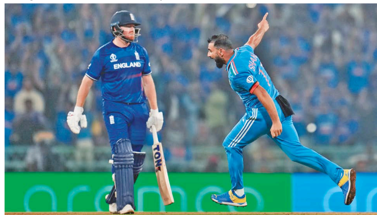
India's Mohammed Shami (right) celebrates the wicket of England's Jonny Bairstow during the Cricket World Cup 2023 in Lucknow on Sunday.

Jos Buttler's side lose by 100 runs to suffer their fifth defeat in six matches at World Cup, leaving their title defence at the mercy of a mathematical miracle.