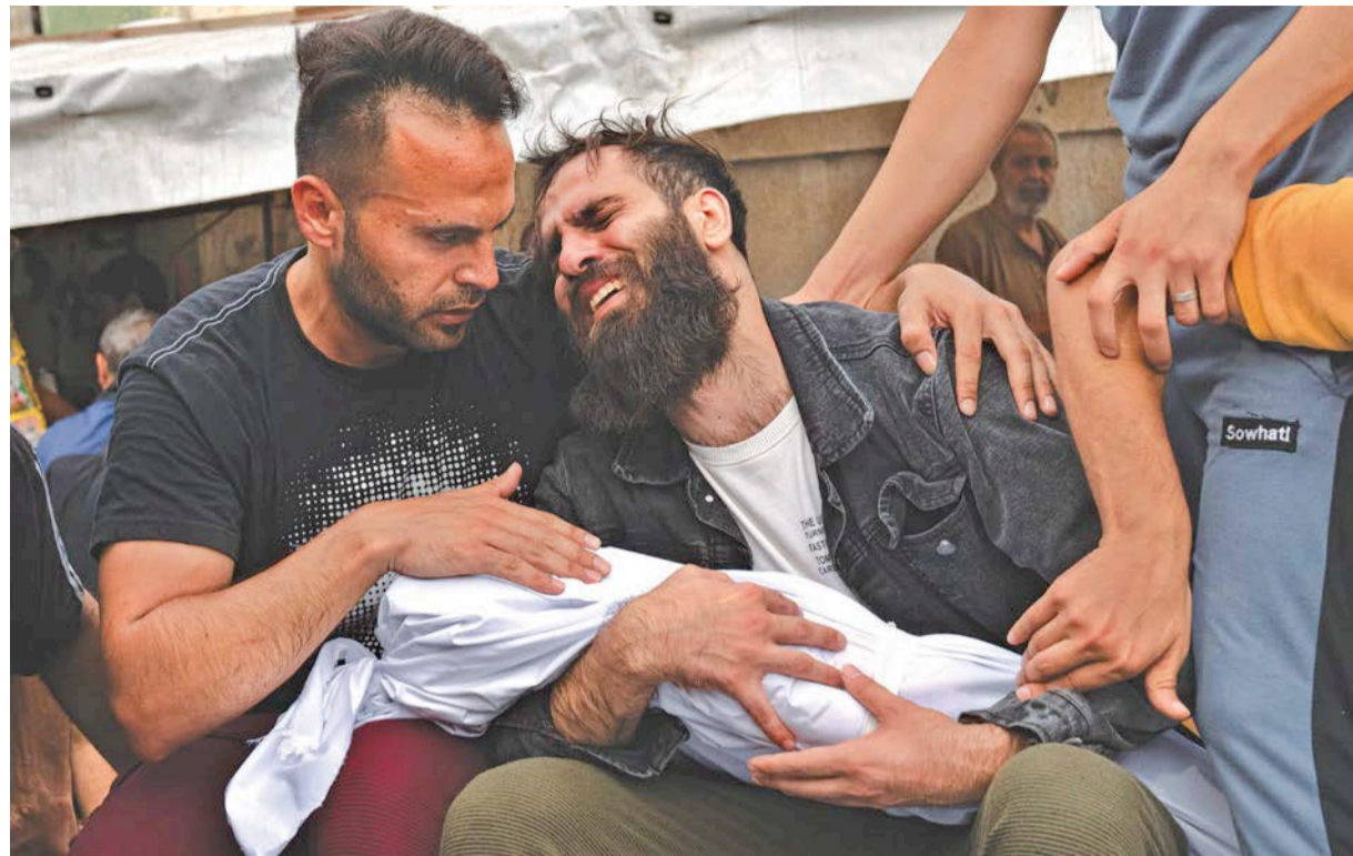
Palestinians mourn their relatives killed in the Israeli bombardment of the Gaza Strip, in a morgue in Khan Younis on Sunday.