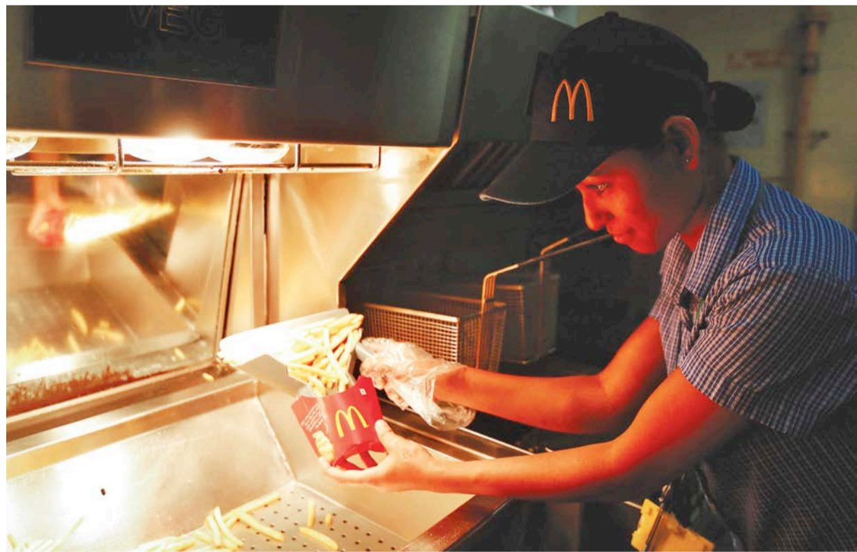
A file photo shows a staff member preparing French fries at a McDonald's restaurant in Mumbai.

However, another Westlife executive said the factors that pressured the franchisee's sales would not "dramatically" change in the third quarter.