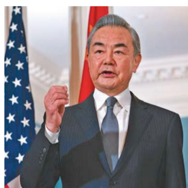
China's Foreign Minister Wang Yi

The statement said that although there are still many issues to be resolved, both sides believe that it is both beneficial and necessary for the US and China to maintain dialogue.