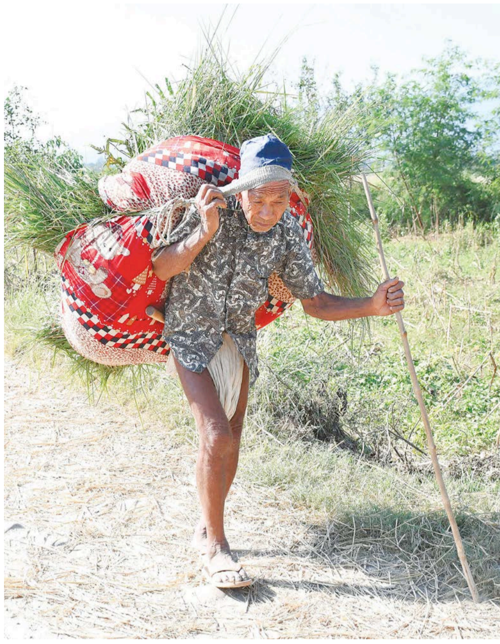
A man makes his way home carrying a load of grass at Lalmatiya, Dang in this recent photo.

In 2021, Korea had 2.6 active clinicians per 1,000 people, including practitioners of Korean traditional medicine. This figure surpasses only Mexico's 2.5 clinicians among OECD member states, according to the report. When traditional medicine practitioners are excluded, Korea ranks at the bottom among OECD nations. Leading the list were Austria, Norway and Germany with 5.4, 5.2 and