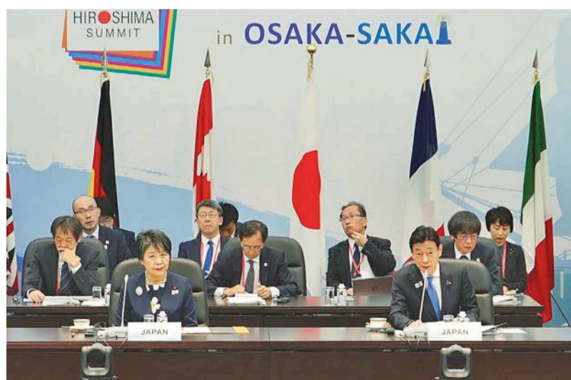
Delegates attend a G-7 Trade Ministers' Meeting in Osaka, western Japan on Sunday.

Worries are growing among developed nations about maintaining a stable supply of computer chips as well as essential minerals, like lithium, which are critical these days amid the demand for electric vehicles