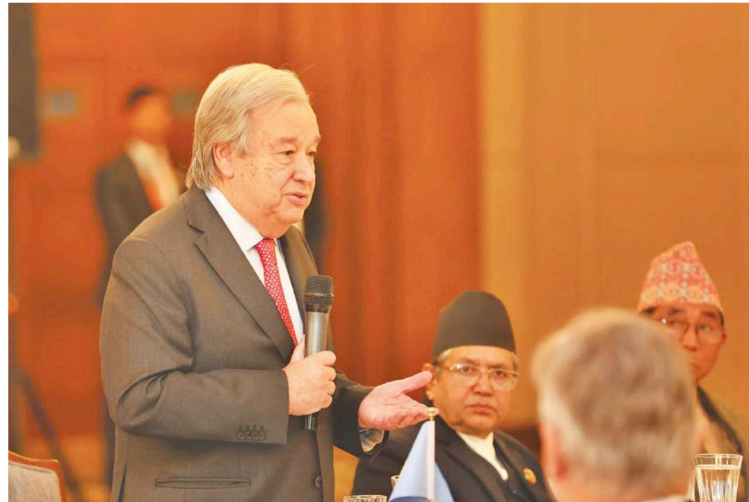
United Nations Secretary General António Guterres delivers a speech at a banquet hosted by Prime Minister Pushpa Kamal Dahal at Singha Durbar, Kathmandu on Sunday.

On Sunday evening, the prime minister hosted a banquet in honour of the UN secretary general and his delegation. Guterres also visited Patan Durbar Square, a UNESCO World Heritage Site, and is scheduled to travel to the Everest region and Pokhara on Monday.