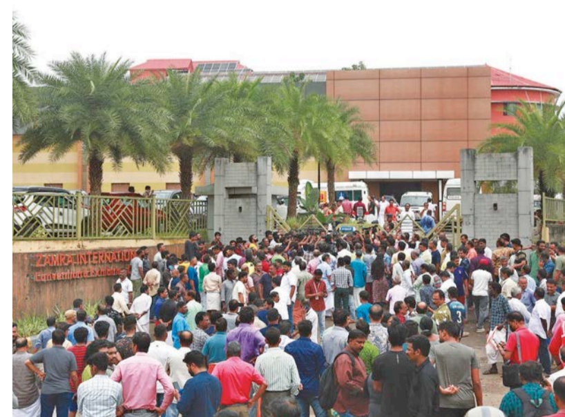
People stand outside a convention centre where multiple blasts occurred during a religious gathering in Kochi, India on Sunday.

An eight-member team from the National Security Guard, the Indian government's counterterrorism unit,