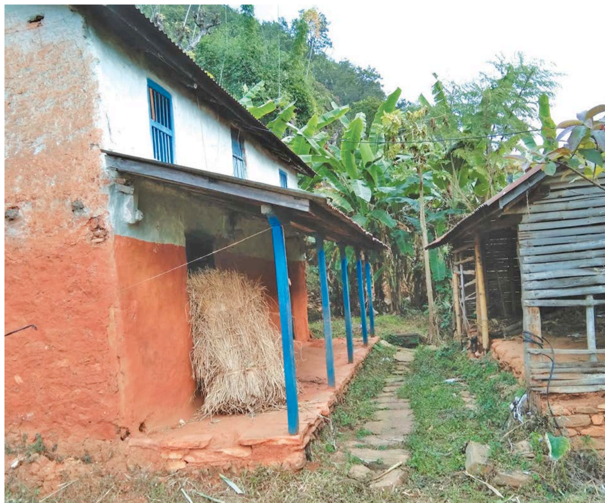
This picture taken earlier this month shows an empty house and animal shed in Jaimini Municipality, as people have left due to frequent landslides.

In August 2021, a landslide in Tunibot settlement in ward 1 of