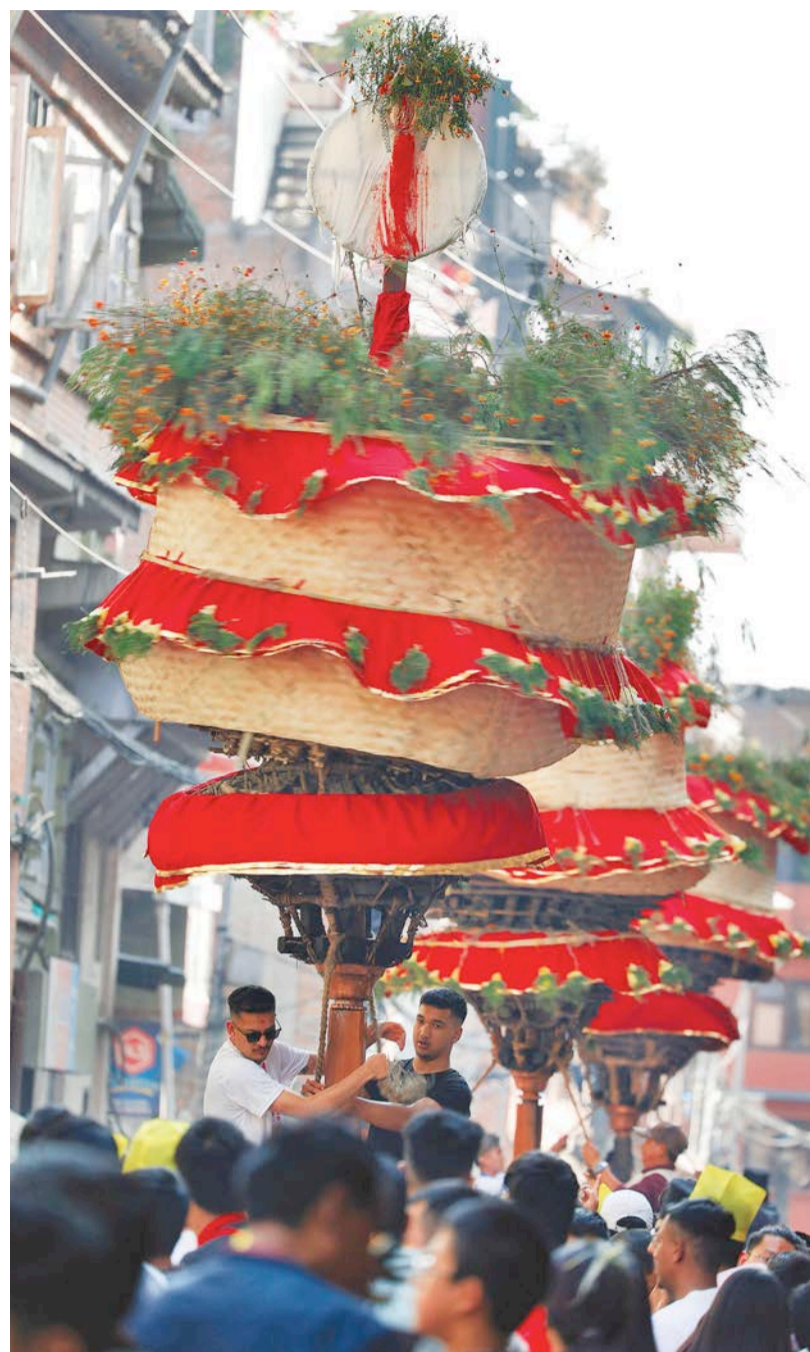
Devotees carry palanquins during the Chakte Narayan Jatra, an exclusive of the Handigaun locale, in Kathmandu on Sunday.

Nepal are set to begin their World Cup Asia Qualifier campaign with a match against Singapore at the TU Ground on Monday, aiming to book a place at the ICC Men's T20 World Cup, their first since 2014. Pg 7