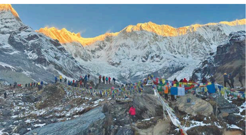
Visitors at the Annapurna Base Camp immediately after the Dashain festival. In Nepal, the most visible effects of climate change are on the mountains.

Ministers meet next week to grapple with such flashpoint issues as future of fossil fuels.