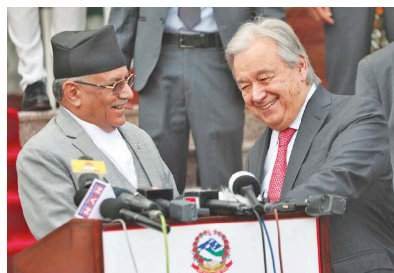
Prime Minister Pushpa Kamal Dahal and UN Secretary General António Guterres on Sunday.

Since the signing of the comprehensive peace accord in 2006, there have been calls from several quarters including the victims of the decade-long insurgency and international community that Nepal's peace process should align with international standards, it should be vic-