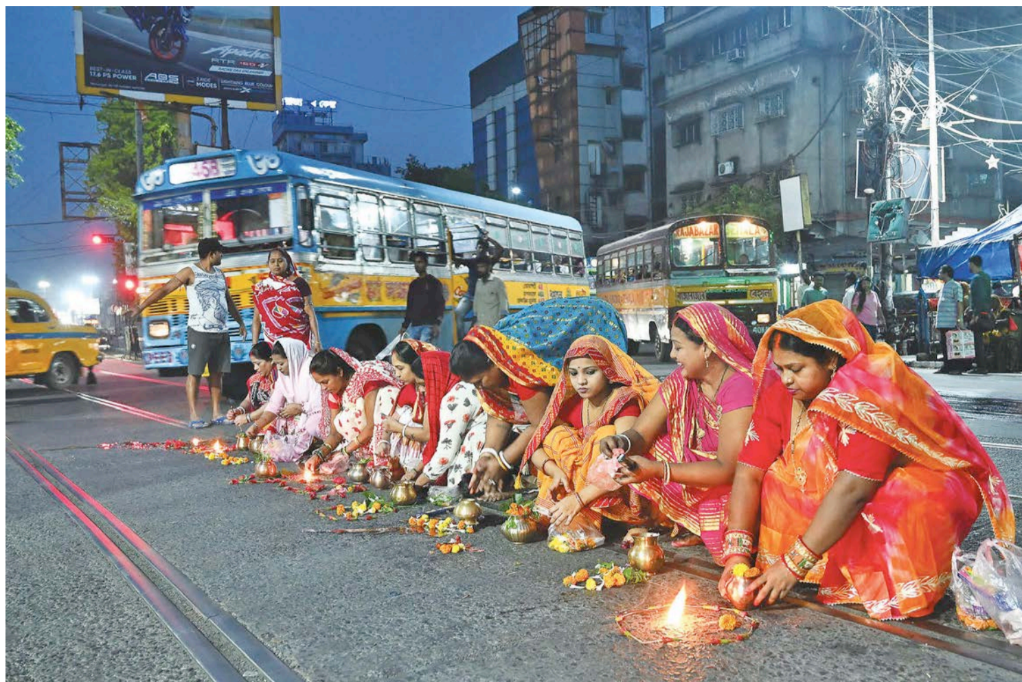
Hindu married women perform a special prayer in the junction of a busy road as a part of religious rituals for the upcoming Hindu festival of Holi in Kolkata on Tuesday.