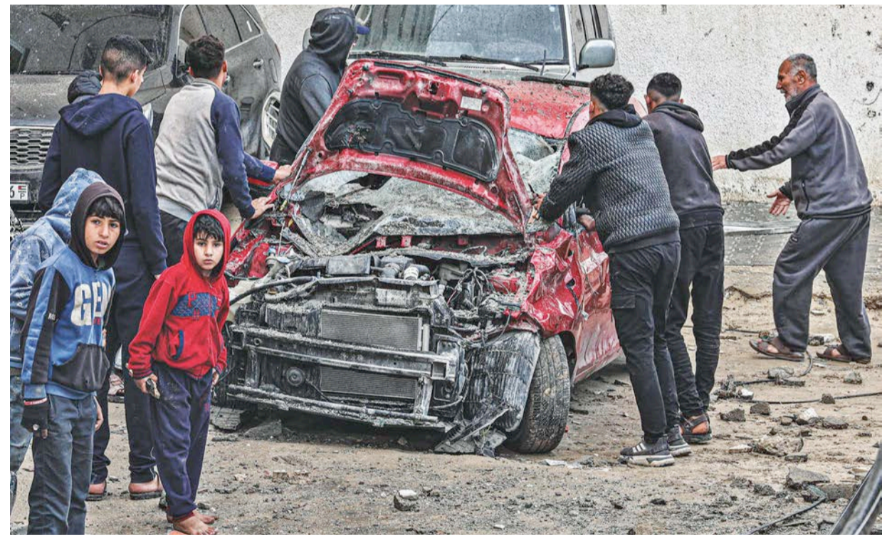
Men and youths gather to inspect a destroyed vehicle following overnight Israeli bombardment at the Rafah refugee camp in the southern Gaza Strip on Tuesday amid the ongoing conflict in the Palestinian territory between Israel and the militant group Hamas.

In Washington, White House National Security Advisor Jake Sullivan reported the death of senior Hamas official Marwan Issa. Israel had on March 11 said an air strike on an underground compound in central Gaza targeted Issa, whom it called the deputy head of Hamas's armed wing. At the time it was unclear if he had been killed.