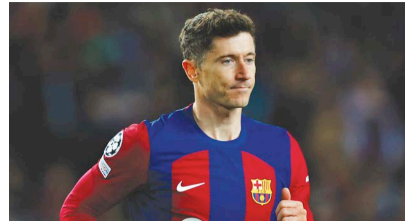
At age 35, and with 82 goals in 146 games for Poland, Robert Lewandowski might have just one finals tournament left in a stellar career.

The 21 teams already in the Euro 2024 lineup are Germany plus the winners and runner-ups in each of 10 traditional qualifying groups played last year. UEFA banned Russia from the competition.