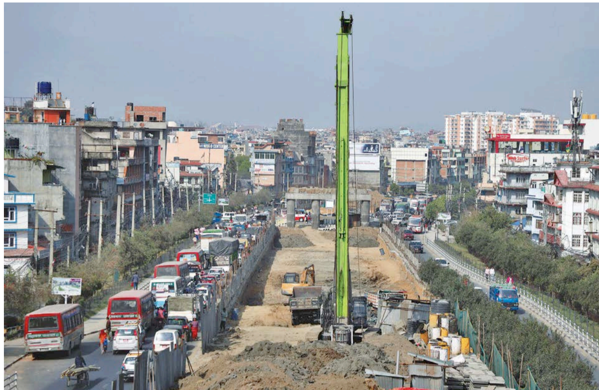
Work on a flyover continues between two bustling road lanes at the Gwarko intersection of the Ring Road in Lalitpur, as pictured on Tuesday. The tall structure is a tower crane. Officials say 40 percent of the work on the project has been completed in 13 months.