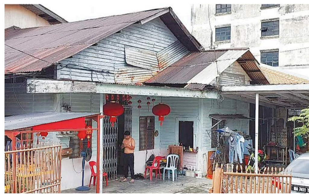
A fourth-generation resident of Sungai Way New Village on the outskirts of Kuala Lumpur outside his home.

British colonialists during the Malayan Emergency from 1948 to 1960, when the country fought a communist insurgency against British rule.