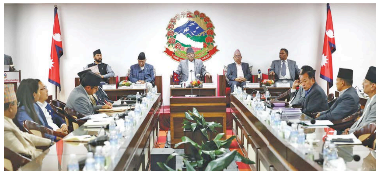
Leaders of the five ruling parties meet to release the government's vision paper at the Prime Minister's Office at Singha Durbar on Tuesday.

The policy paper also vows to strengthen regulatory bodies like the Commission for the Investigation of