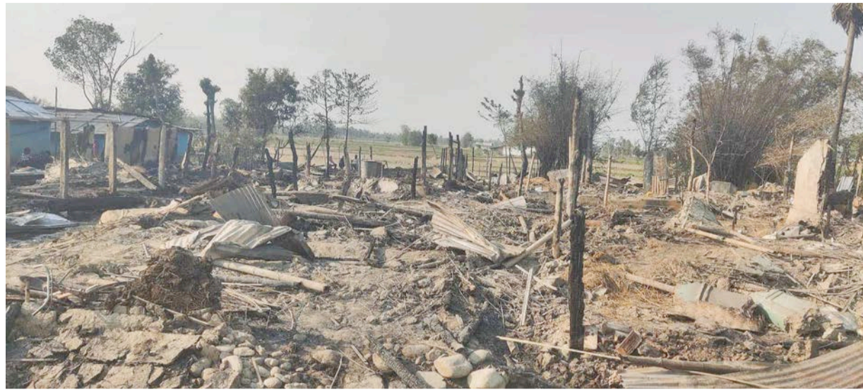
The Santhal settlement at Babusaheb tole in Morang that was burned to a cinder in the fire last Saturday.

Carelessness and electric short-circuits caused most of the fire incidents, police say.