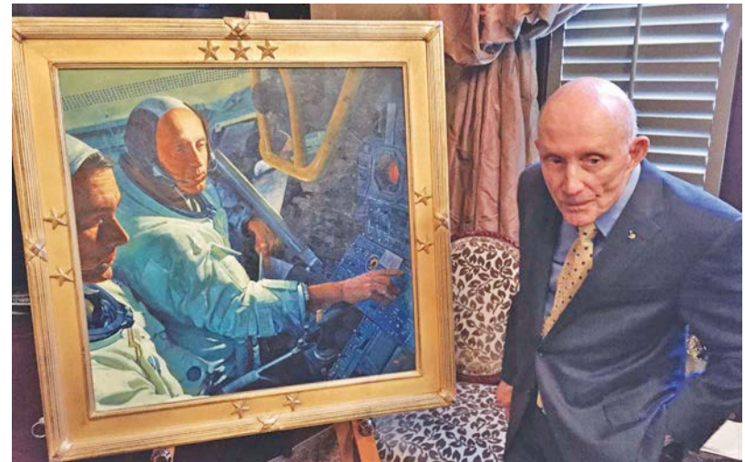
In this 2016 photo, astronaut Stafford, who flew the first lunar module to the moon in 1969, stands in front of a portrait made in his honor in the Oklahoma House of Representatives.

Stafford was the go-to guy for NASA when it sought independent advice on everything from human Mars missions to safety issues to returning to flight after the 2003 space shuttle Columbia accident. He chaired an oversight group that looked into how