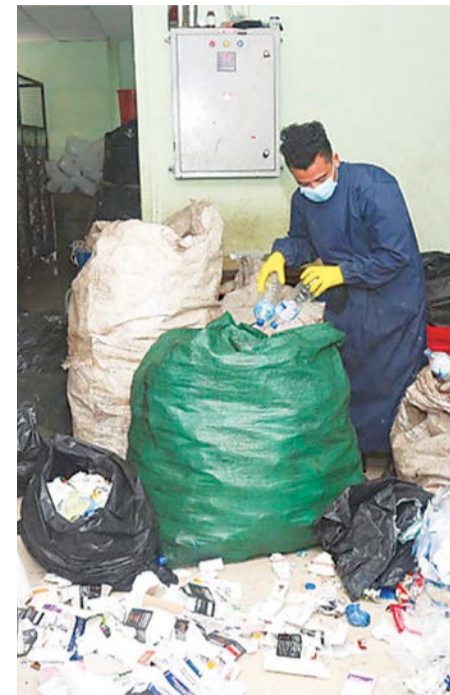
City planners and environmentalists have called the City's latest move aimed at solving the waste management problem a good initiative.

They started doing so, using separate bins in their homes. But the plan did not succeed, largely due to a lack of preparations on the part of the Kathmandu Metropolitan City office.