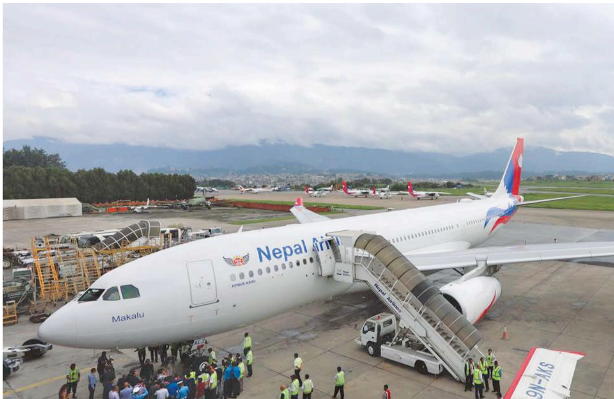
The first of the two A330s wide-body planes, Annapurna, was delivered in June 2018. The second, Makalu (pictured), arrived a month later.