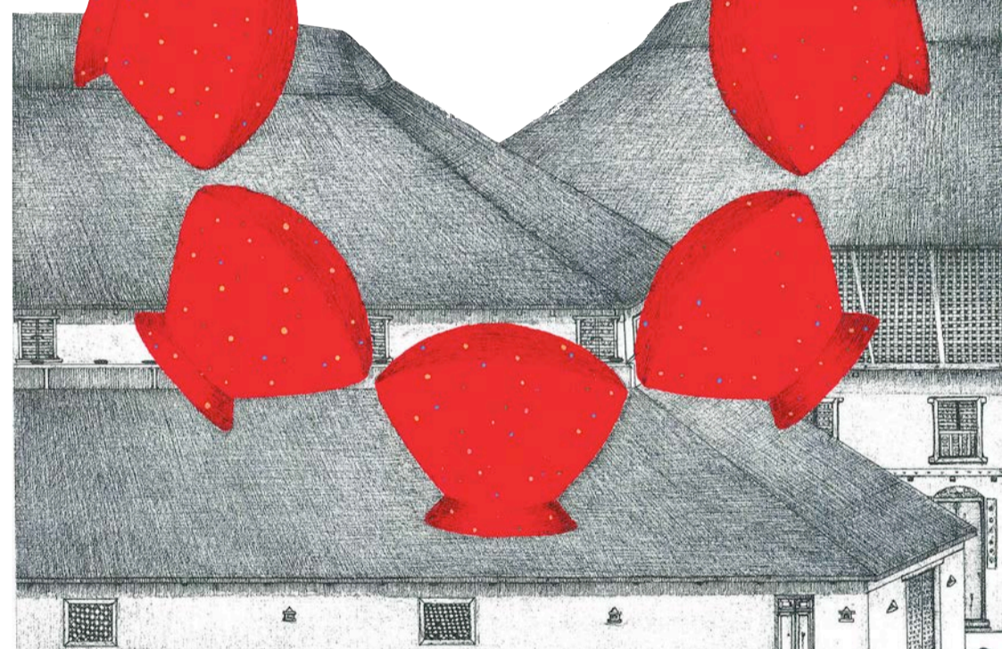
A piece from 'Fragments of My Wall' series, where the artist has painted everyday objects with traditional Kathmandu homes as background.