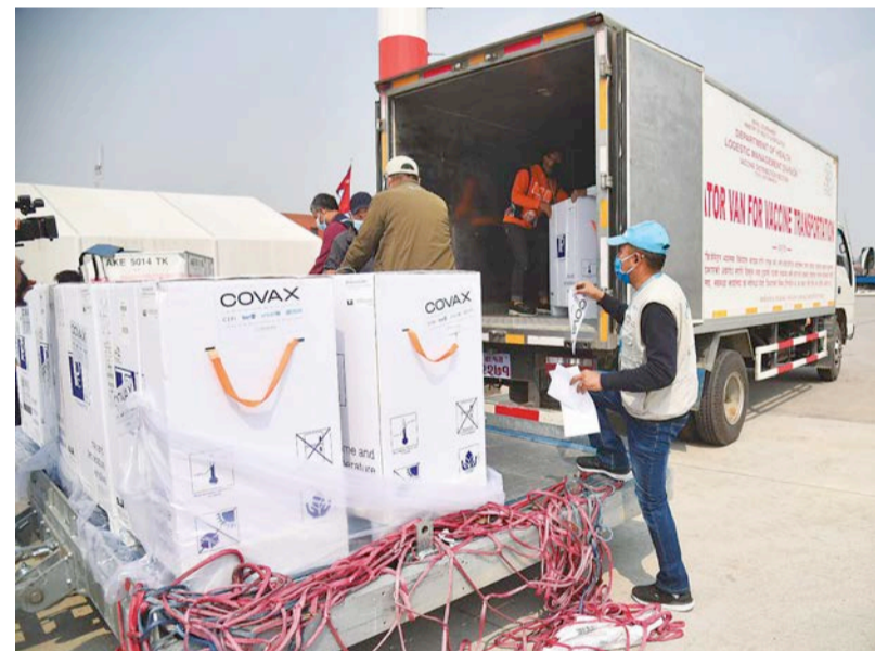
Officials in Kathmandu receive delivery of Covid jabs supplied by Covax, in this undated photo.

Currently Covid vaccine is being provided from the Teku-based Sukraraj Tropical and Infectious Disease Hospital. The hospital administration said that anyone from risk groups or those, who have not taken the first dose, second dose or booster shots can visit for inoculation.