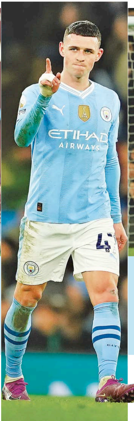
Phil Foden (pictured) justified Pep Guardiola's decision to leave Erling Haaland on the bench by netting a stunning hat-trick against Aston Villa.

"His work ethic is amazing," Guardiola said. "He plays in central positions and has an incredible sense of goal—he has goals in his