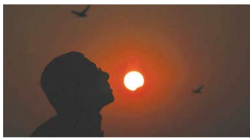
A partial solar eclipse seen from the Swayambhunath temple in Kathmandu on March 9, 2016.

According to the late Lama Zopa Rinpoche with the Foundation for the Preservation of the