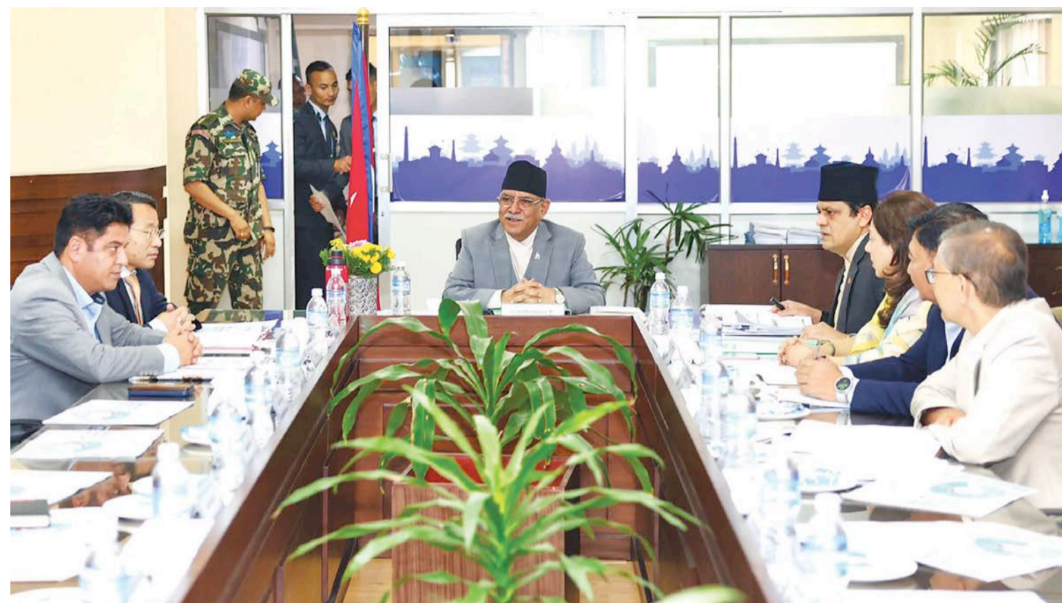
Prime Minister Pushpa Kamal Dahal (centre) chairs a meeting of the Investment Board Nepal on Thursday.

The board extends tenure of panel to study modalities of Nijgadh International Airport Project until July 16.