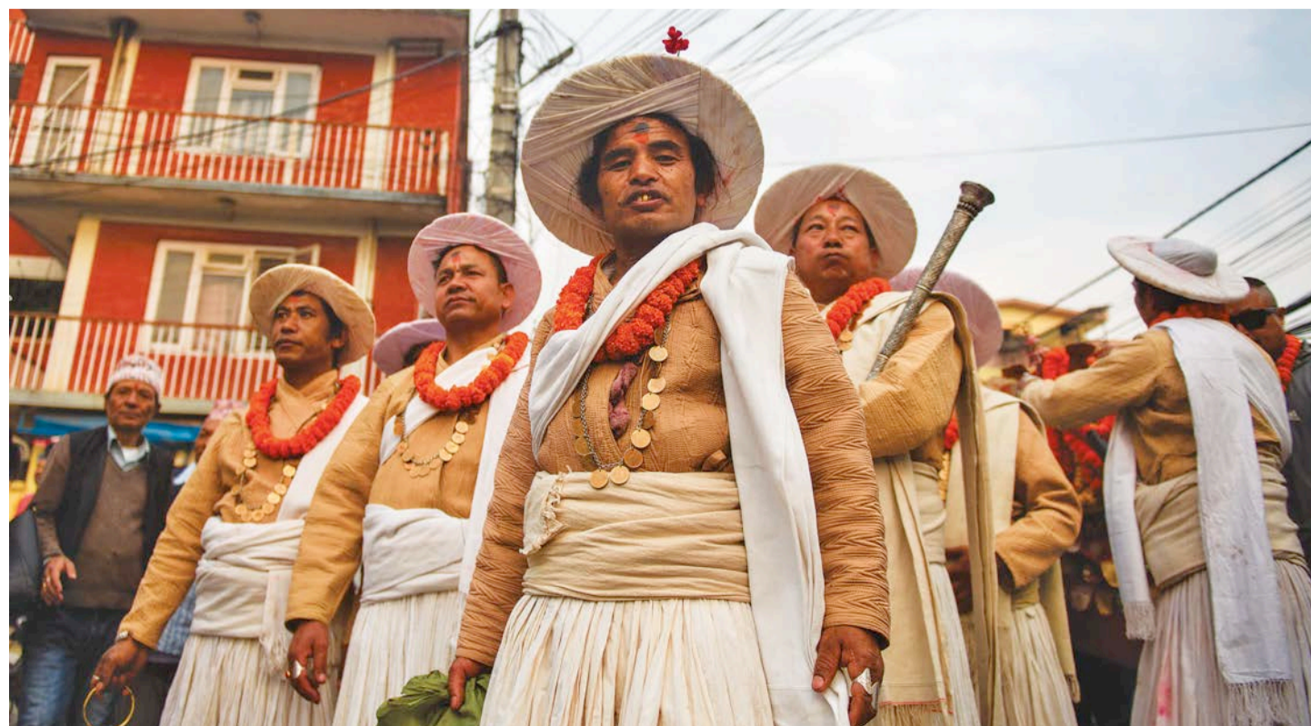
Residents of Khokana village in Lalitpur, dressed in special attire, pictured at Ekantakuna in the district on Thursday as they marched towards Kathmandu Durbar Square for worship as part of the Shikali Jatra tradition. The Jatra is celebrated in various parts of the Kathmandu Valley every 12 years.

As cases in the hospitals keep rising, doctors suggest the public to avoid crowds and follow public health measures—washing hands and wearing face masks, among other things.