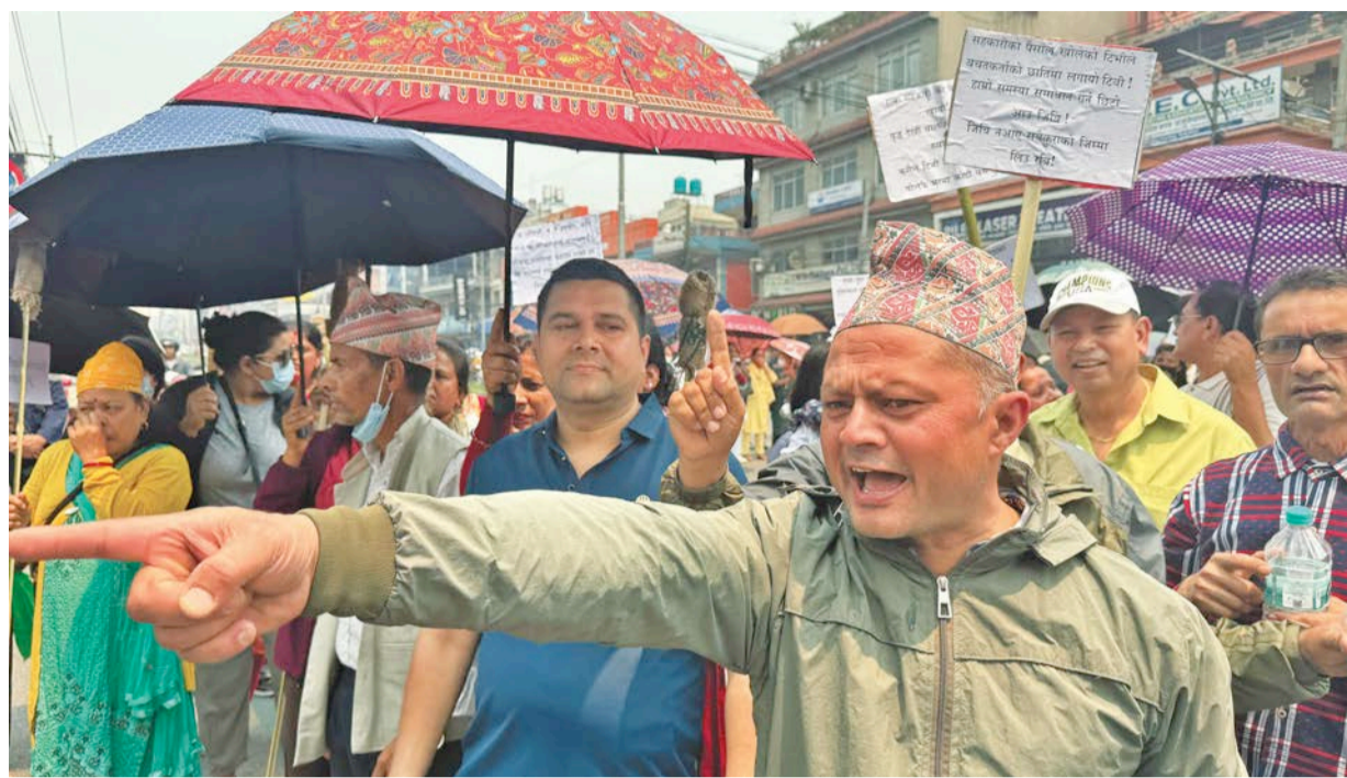
Depositors defrauded of their savings by various cooperatives in Kaski take to the streets in Pokhara on Monday, demanding the return of their money and action against those involved in the embezzlement. They accuse Deputy Prime Minister and Home Minister Rabi Lamichhane of obstructing fair investigations into the scam. (Report on page 2)