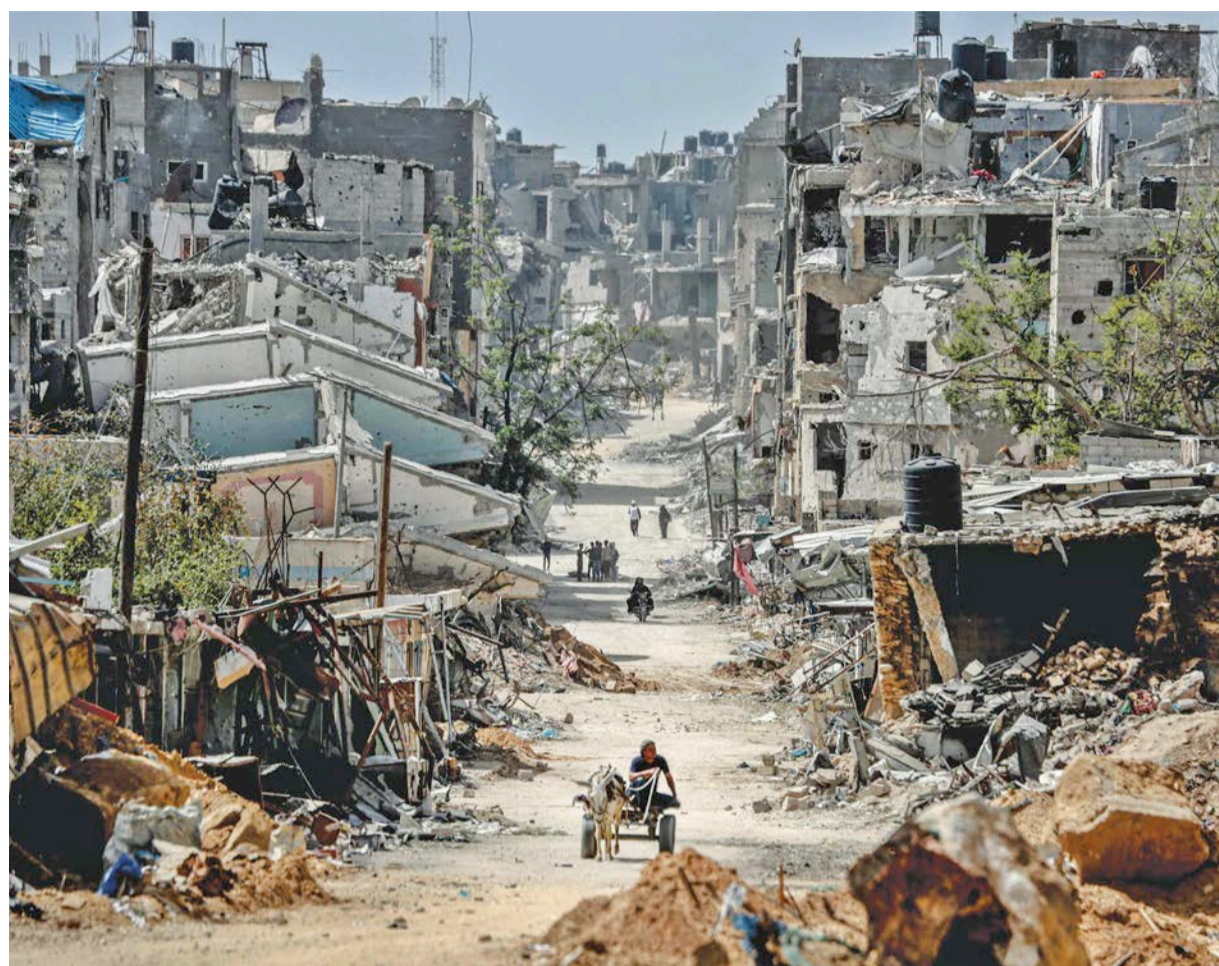
Palestinians walk on a road lined with destroyed buildings in Khan Yunis in the southern Gaza Strip on Monday amid the ongoing conflict in the Palestinian territory between Israel and the militant group Hamas.

"Most alleged neutrality breaches relate to social media posts" which