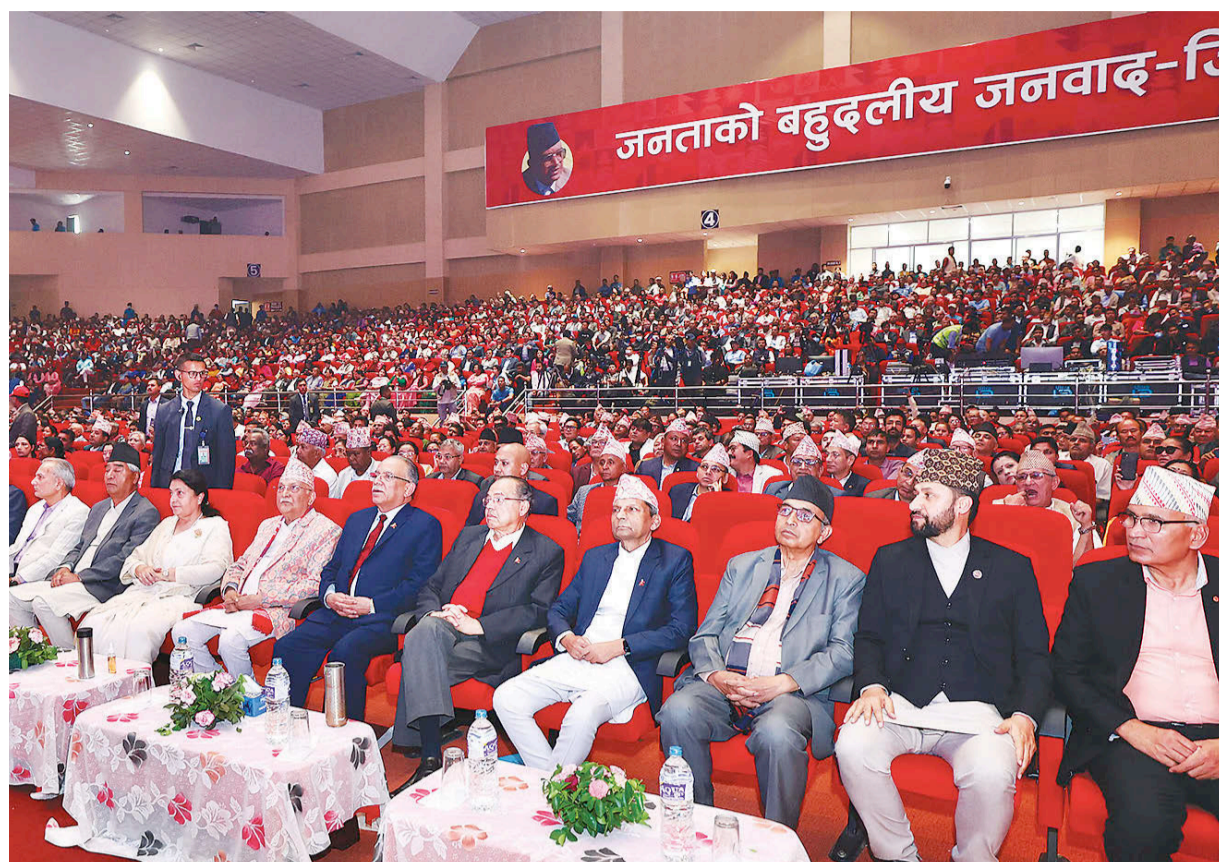
Nepal's top political leaders pictured at the Diamond Jubilee of the establishment of Nepal Communist Party in Godavari, Lalitpur, on Monday.

"Now we are not in favour of communist unity, unlike in the past," Prime Minister Dahal said. "I feel like we were a little too enthusiastic when we unified the party last time, but this time around we are focusing on