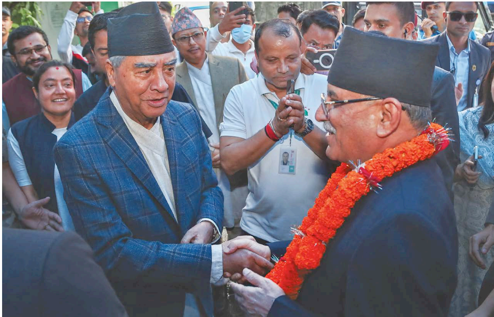
Prime Minister Pushpa Kamal Dahal (right) and Nepali Congress President Sher Bahadur Deuba meet during a photo exhibition on the late Girija Prasad Koirala at Sanepa in Lalitpur on Tuesday.