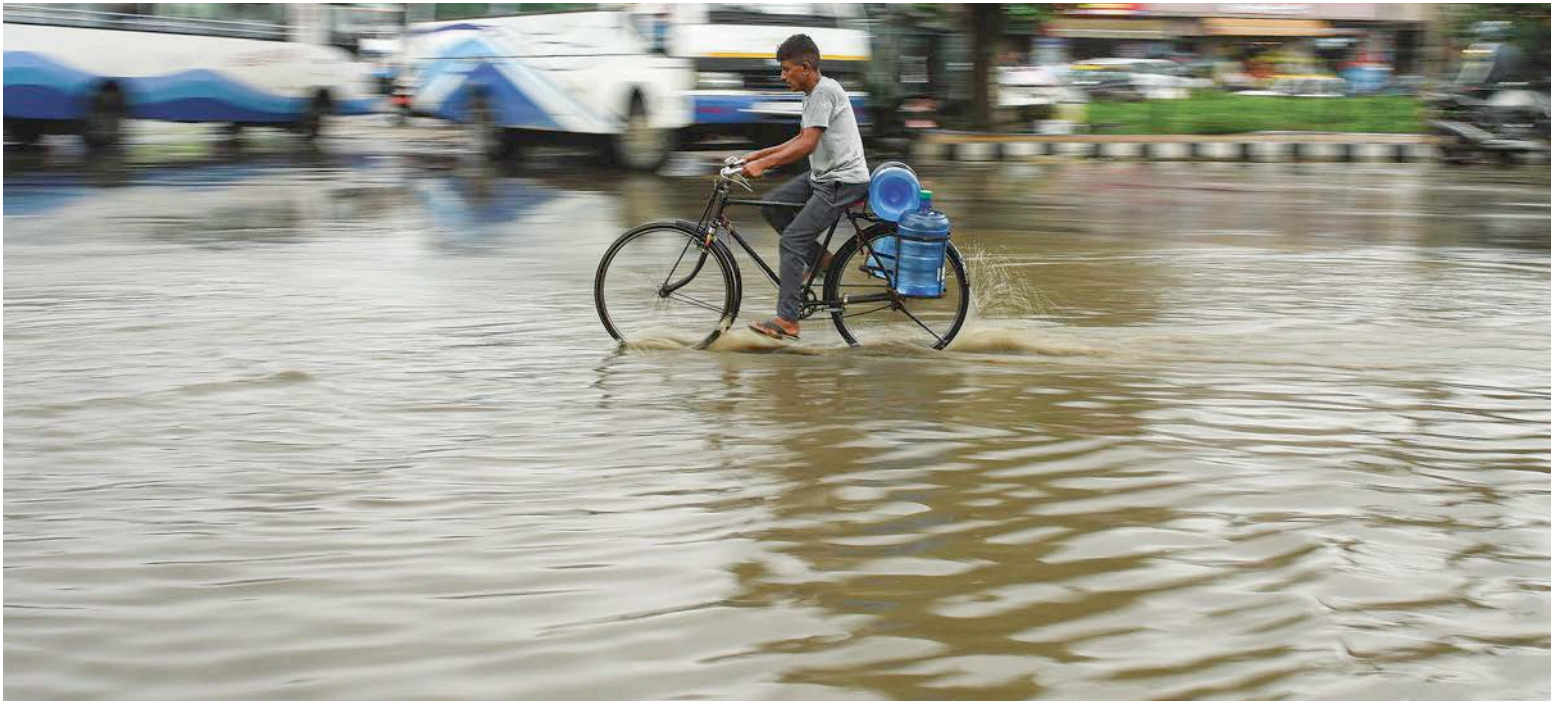
A man pedals through a waterlogged road at Lagankhel, Lalitpur on Tuesday afternoon.