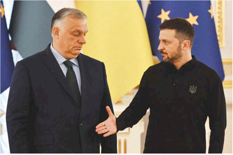
Ukraine's Volodymyr Zelensky (right) with Hungary's Prime Minister Viktor Orban in Kyiv.

Hungary’s Moscow-friendly prime minister Viktor Orban urged Kyiv on Tuesday to work towards a “quick ceasefire” in Ukraine that could pave the way for negotiations with Russia to end more than two years of war. Orban issued the appeal standing next to President Volodymyr Zelensky during a surprise visit to Ukraine, the first by the vocal critic of Western support for Kyiv. “I asked the president to consider whether... a quick ceasefire could speed up the peace talks,” Orban told reporters, adding that the ceasefire he envisioned would be “time-limited”. Ukraine has repeatedly rejected calls for a pause in fighting, which it says would just give Russia time to regroup for a fresh assault. The United States meanwhile on Tuesday announced new security aid for Ukraine worth $2.3 billion. Unlike many other European leaders, Orban had not visited Kyiv since Russia invaded in February 2022 and is widely seen as the 27-member bloc’s most pro-Russian leader. In October 2023 he met Russian President Vladimir Putin at a summit in Beijing, becoming the first EU leader to do so since the start of the war. The populist leader, in power since 2010, regularly criticises Europe’s financial and military support for