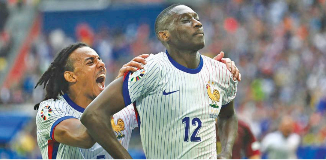
France's winning goal arrived in the 85th minute when substitute Randal Kolo Muani's (right) shot deflected off Belgium defender Jan Vertonghen inside the penalty area and went past goalkeeper Koen Casteels.

Les Bleus have scored only three times in four games but they have kept a third clean sheet in a tournament in which they have let in a solitary goal.