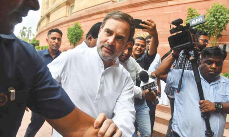
Indian National Congress leader Rahul Gandhi at the Parliament in New Delhi on June 26.

‘Taking off from records my considered remarks goes against the very tenets of parliamentary democracy.’